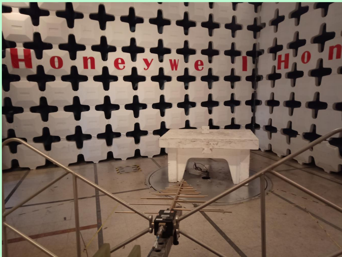
Radiated Emission Setup –30 MHz to 1 GHz [ Horizontal Polarization]