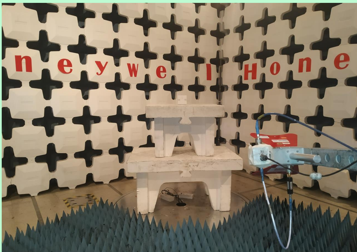
Radiated Emission Setup –1 GHz to 10 GHz [ Horizontal Polarization ]