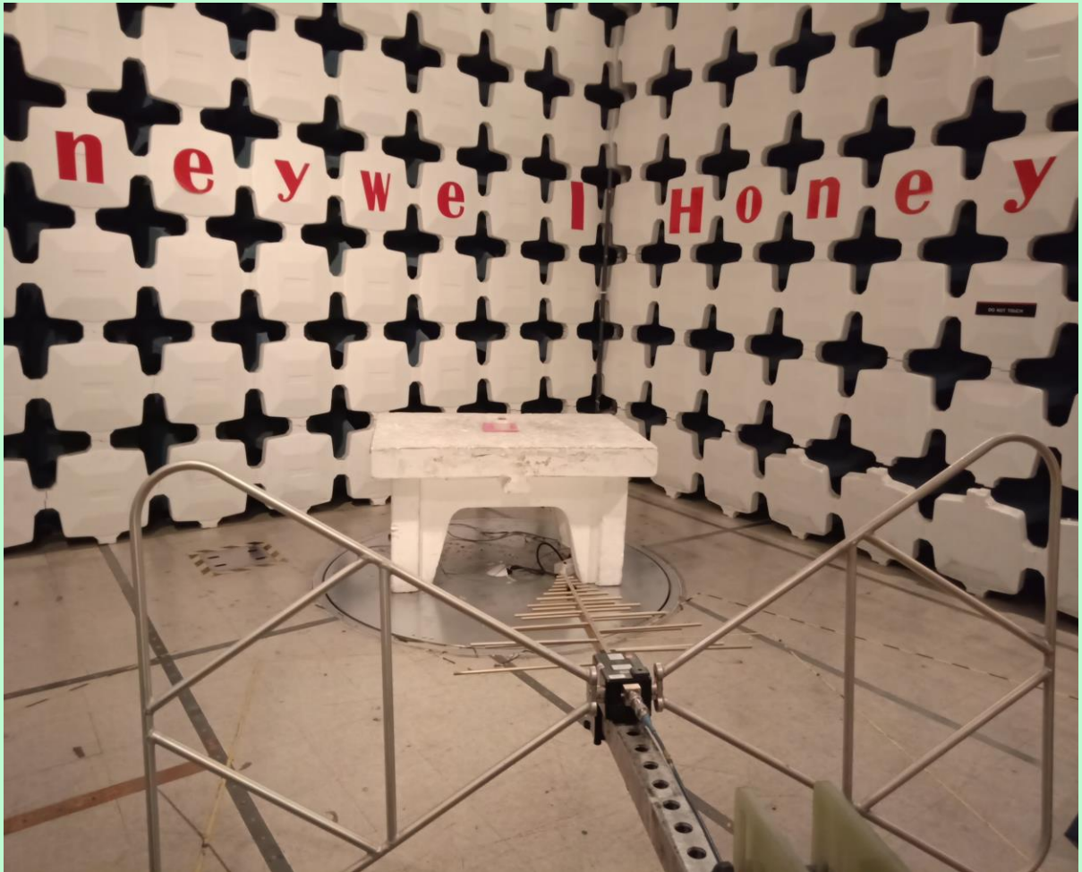
Radiated Emission Setup -30 MHz to 1 GHz [ Horizontal Polarization]