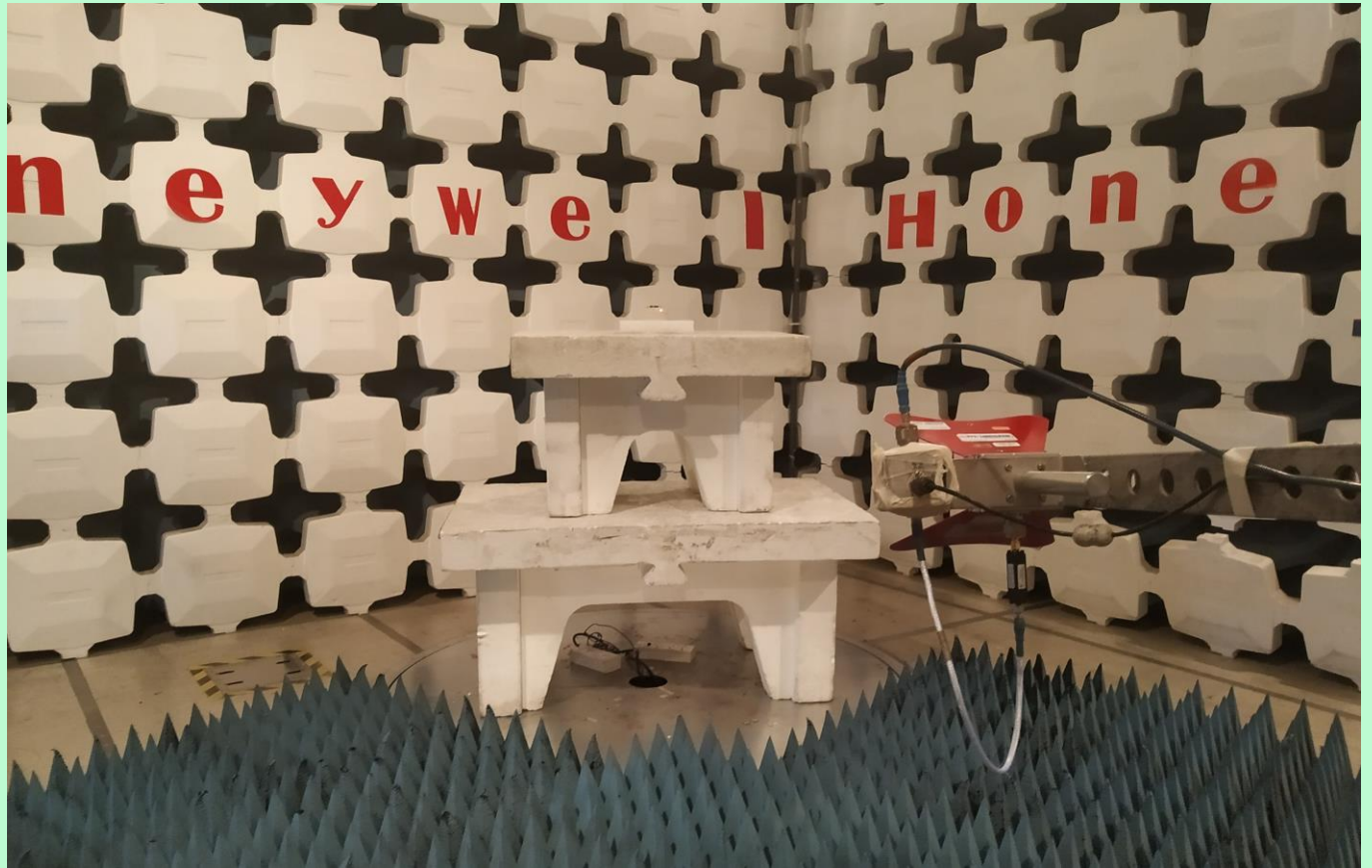
Radiated Emission Setup –1 GHz to 10 GHz [ Vertical Polarization]