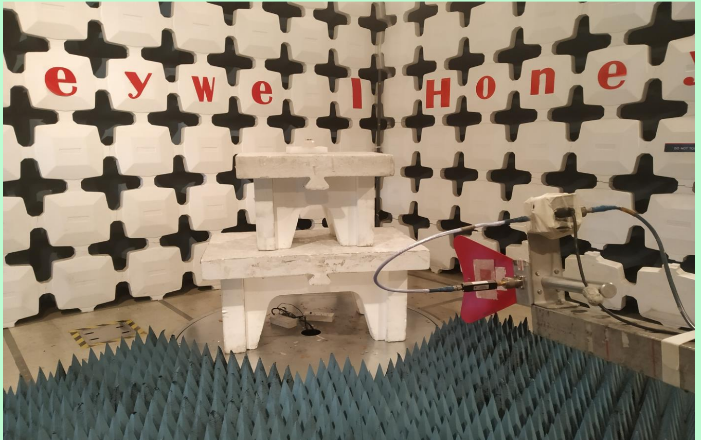
Radiated Emission Setup -1 GHz to 10 GHz [Horizontal Polarization]