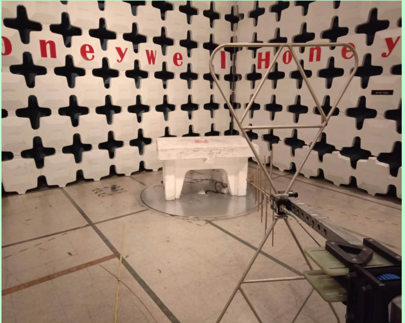
Radiated Emission Setup -30 MHz to 1 GHz [ Vertical Polarization]