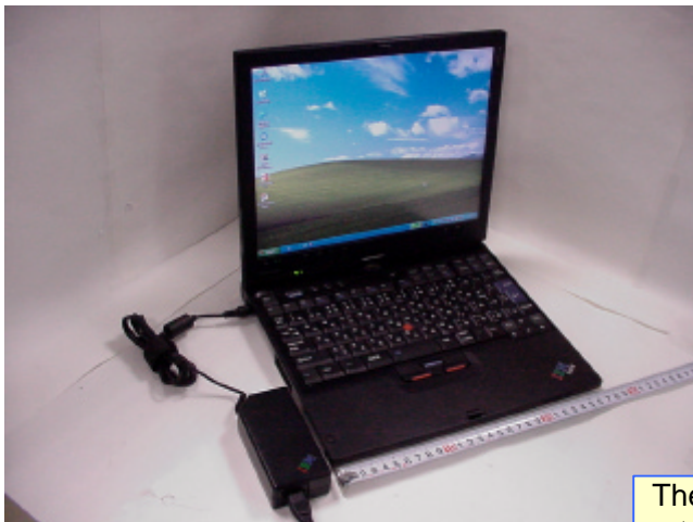
“Notebook” operation mode