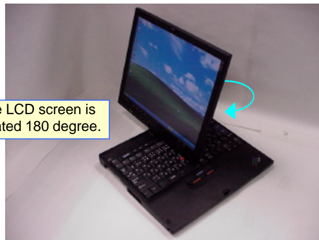
“Tablet” operation mode