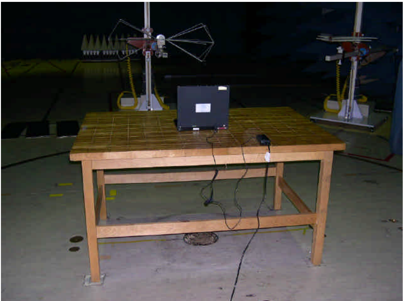
EMI-Radiation, Rear view