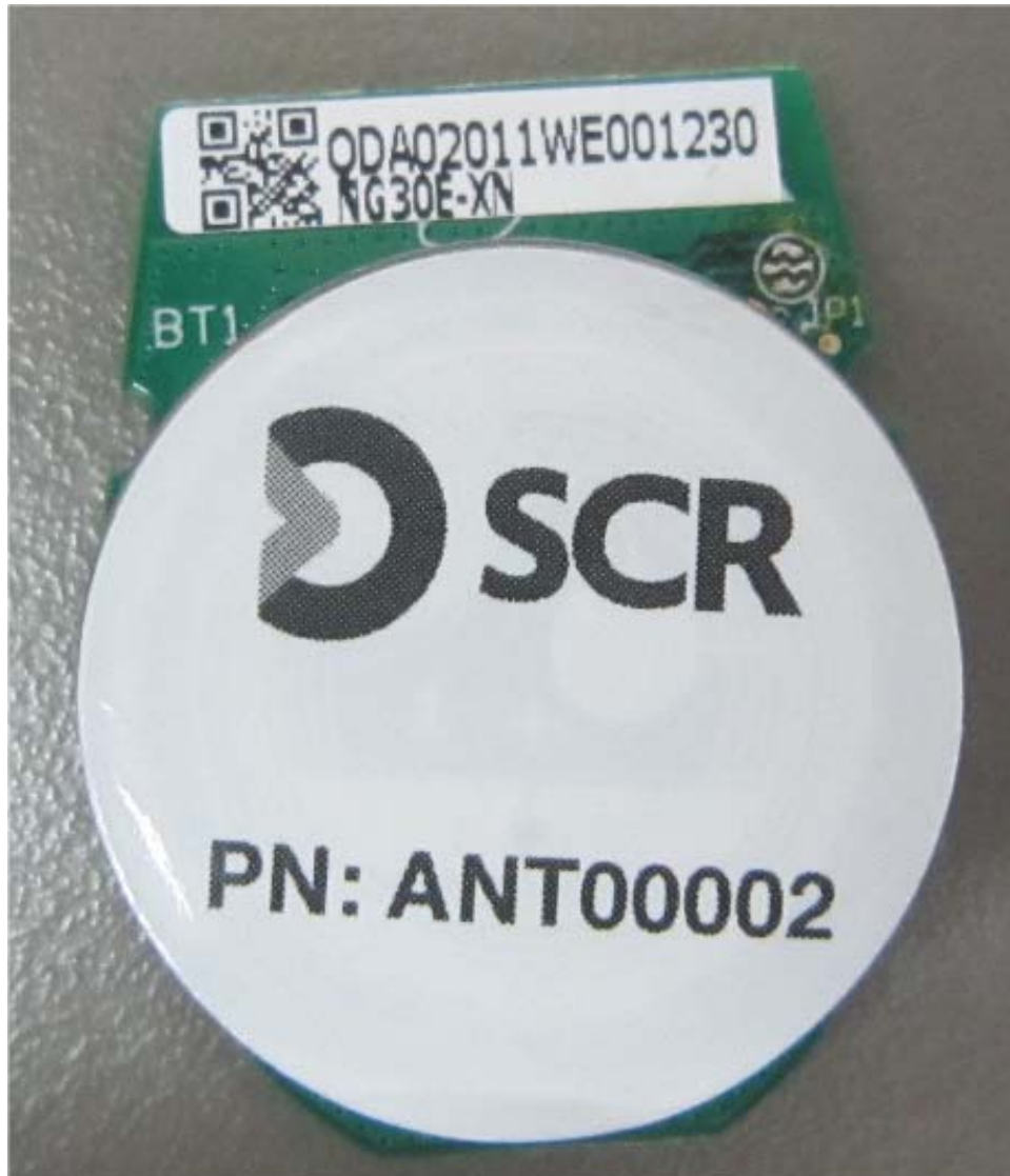
Photograph No.1 eSense Ear TAG internal view