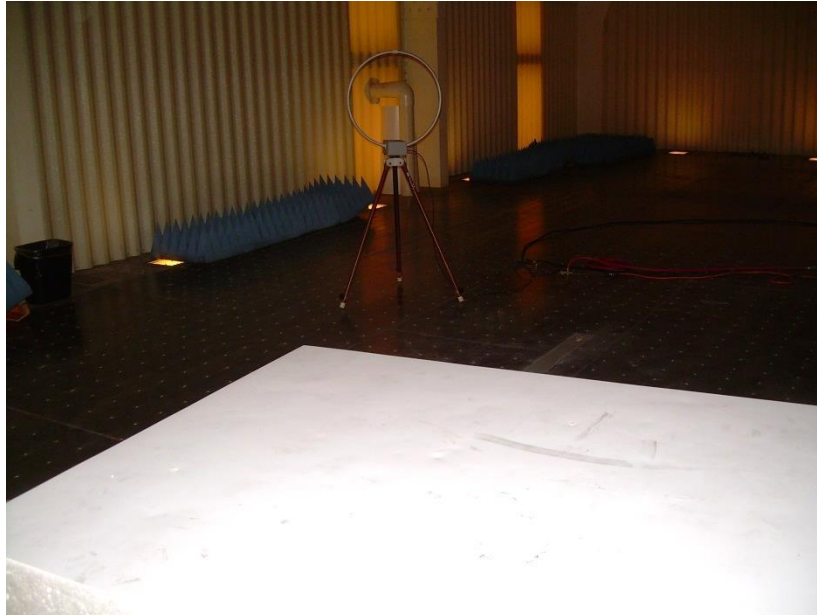
Photograph 11: Reference Photo of Test Setup for Emissions Below 30 MHz