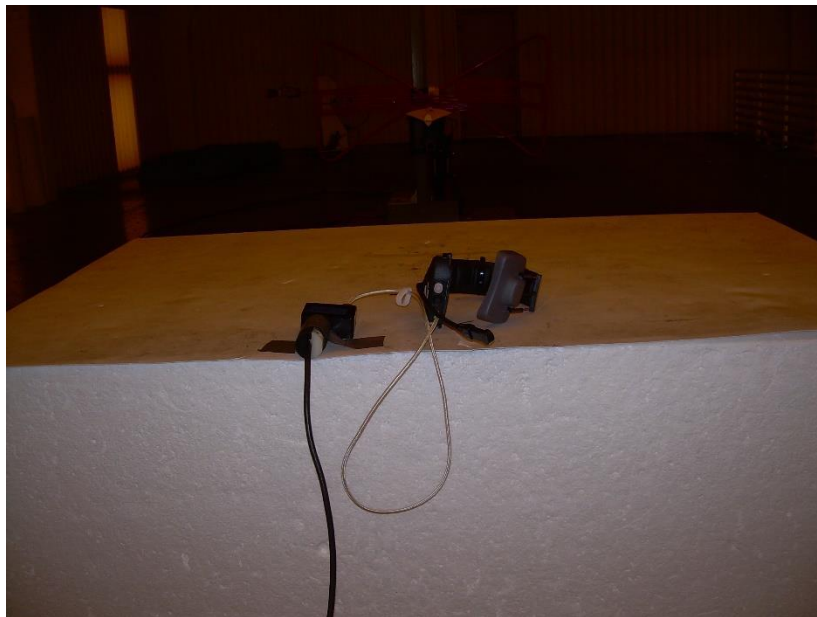
Photograph 2: Back View Radiated Emissions Worst Case, Charging Mode – Below 1000 MHz