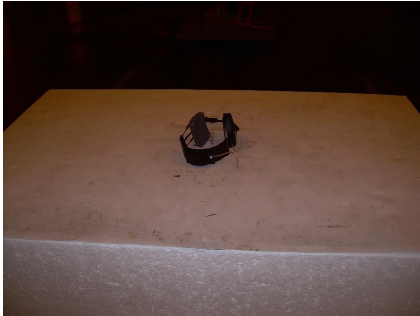
Photograph 7: View Radiated Emissions Flat Placement