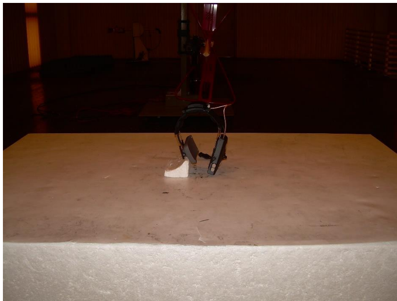
Photograph 6: View Radiated Emissions Worst Case, Vertical