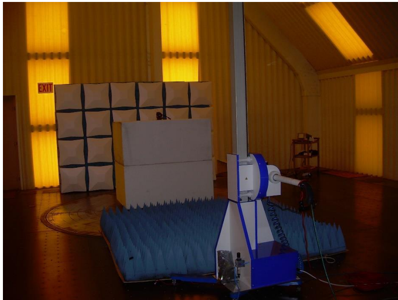
Photograph 4: Front View Radiated Emissions Worst Case – Above 1000 MHz Configuration