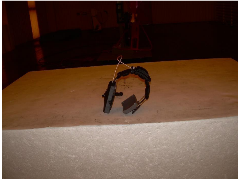
Photograph 3: Front View Radiated Emissions Worst Case, Communication Mode – Below 1000 MHz