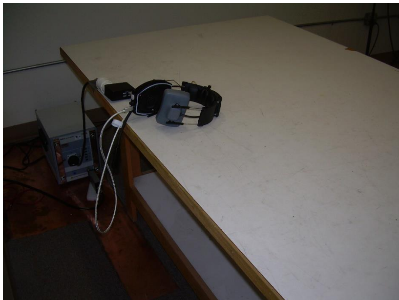
Photograph 10: Back View Conducted Emissions Worst Case