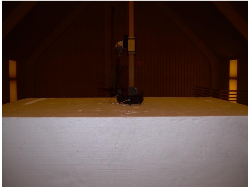
Photograph 5: Back View Radiated Emissions Worst Case – Above 1000 MHz Configuration