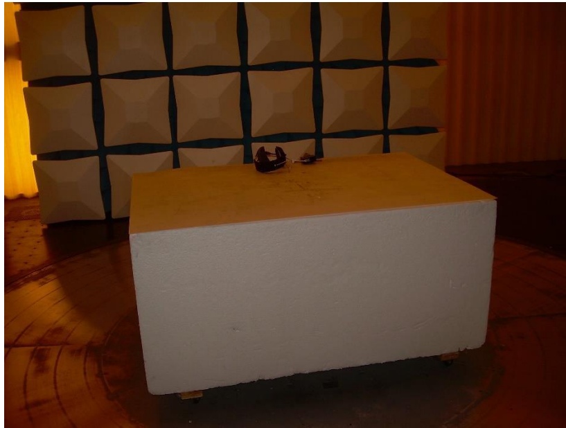
Photograph 1: Front View Radiated Emissions Worst Case, Charging Mode – Below 1000 MHz