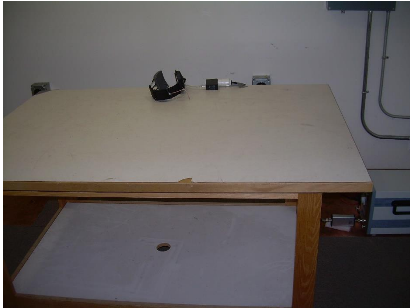
Photograph 9: Front View Conducted Emissions Worst Case