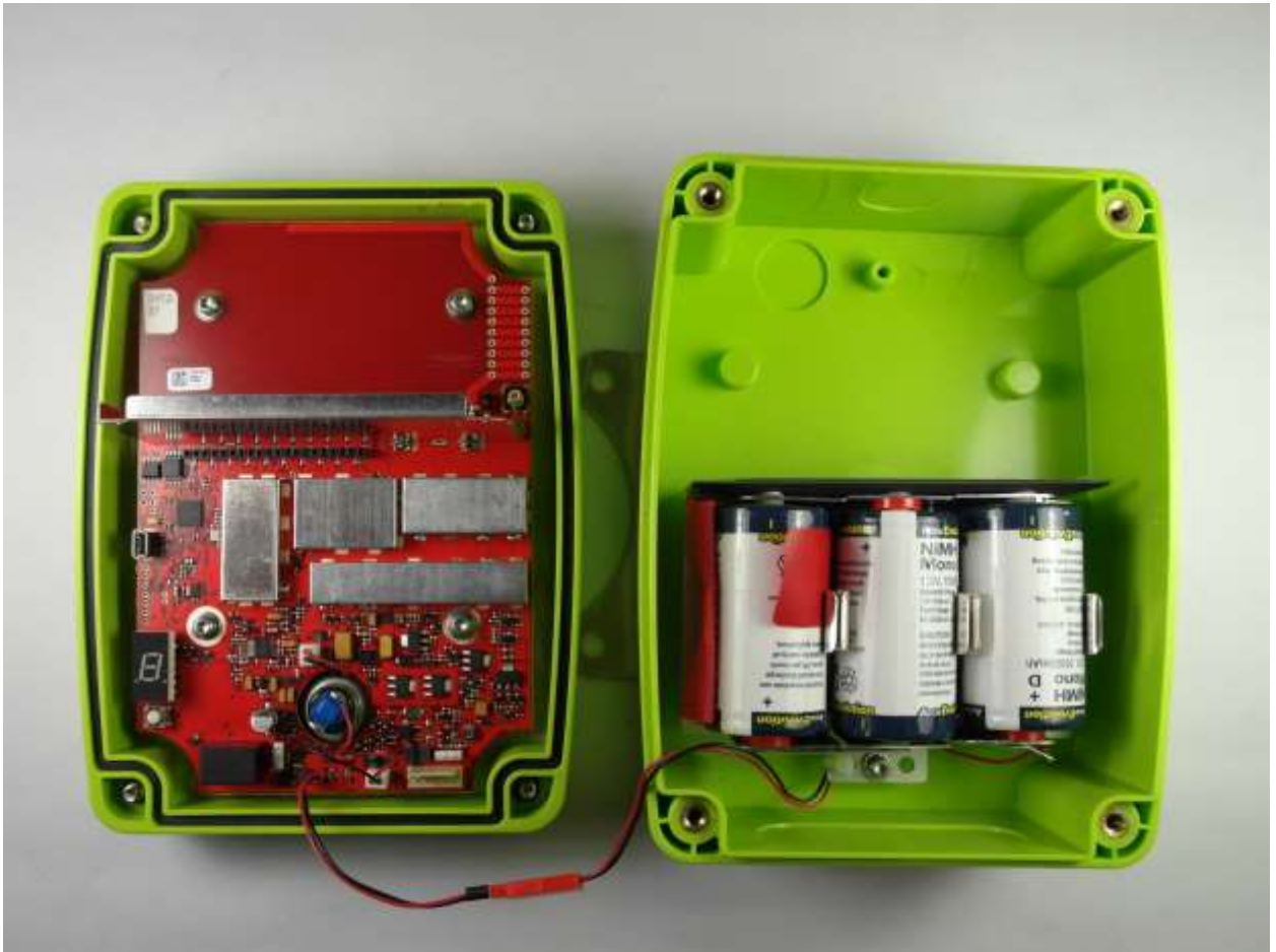
EXHIBIT: RQX-417NX with 3 D-cell batteries. Case open to show printed circuit board installation FCC ID: AIERIT41-417