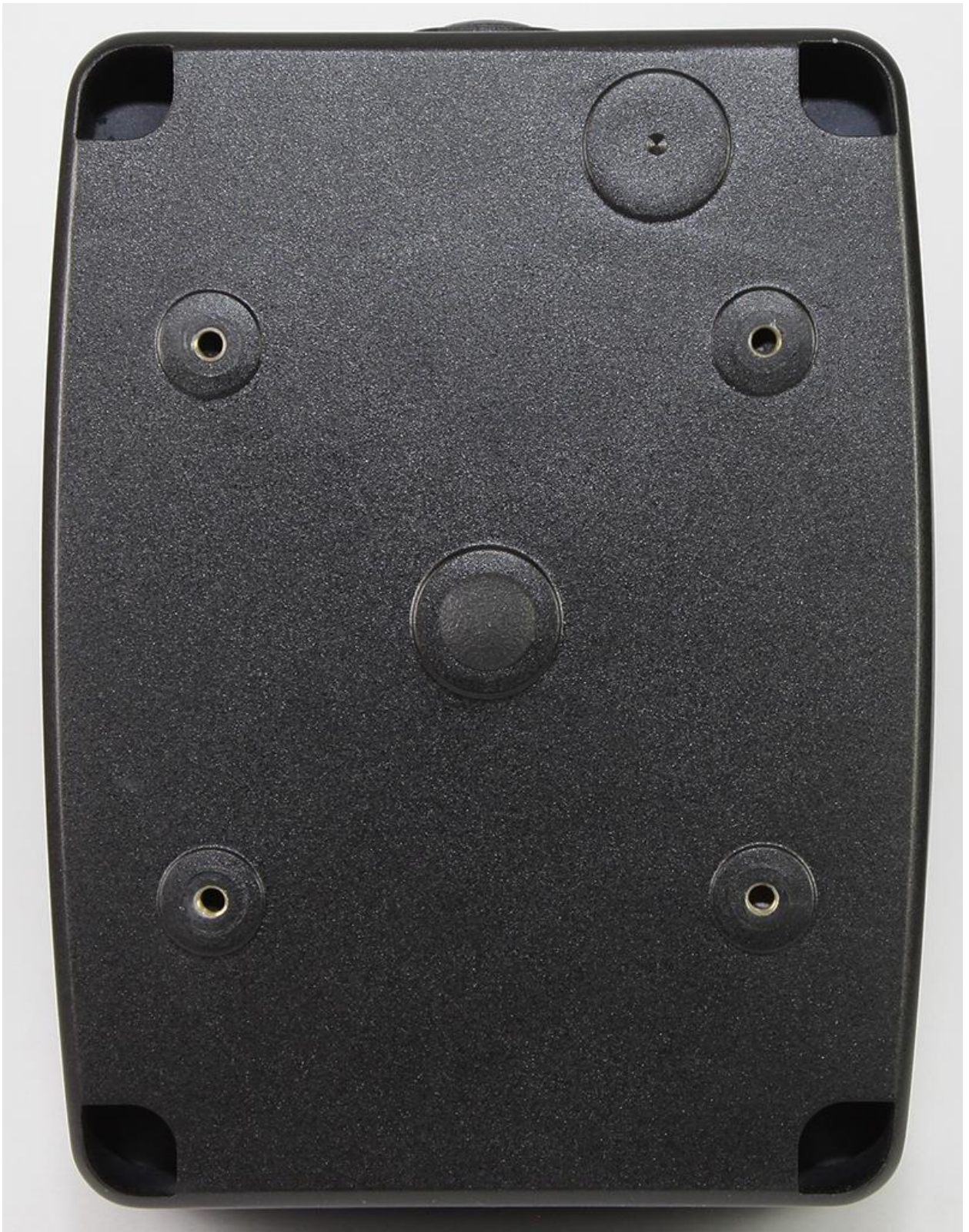
EXHIBIT: RQX-117NX back view