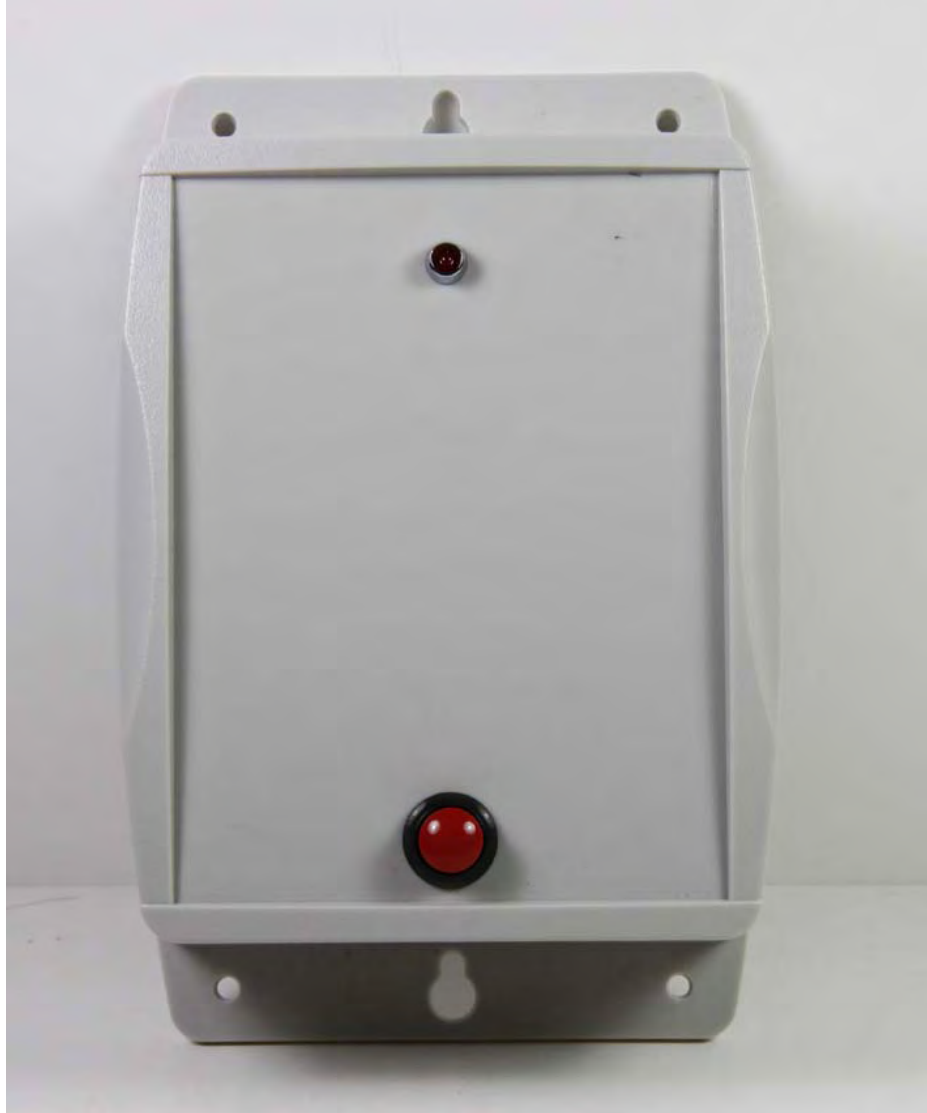
EXHIBIT: RQA-451 front view with no label (front panel label included as separate exhibit) FCC ID: AIERIT32-451