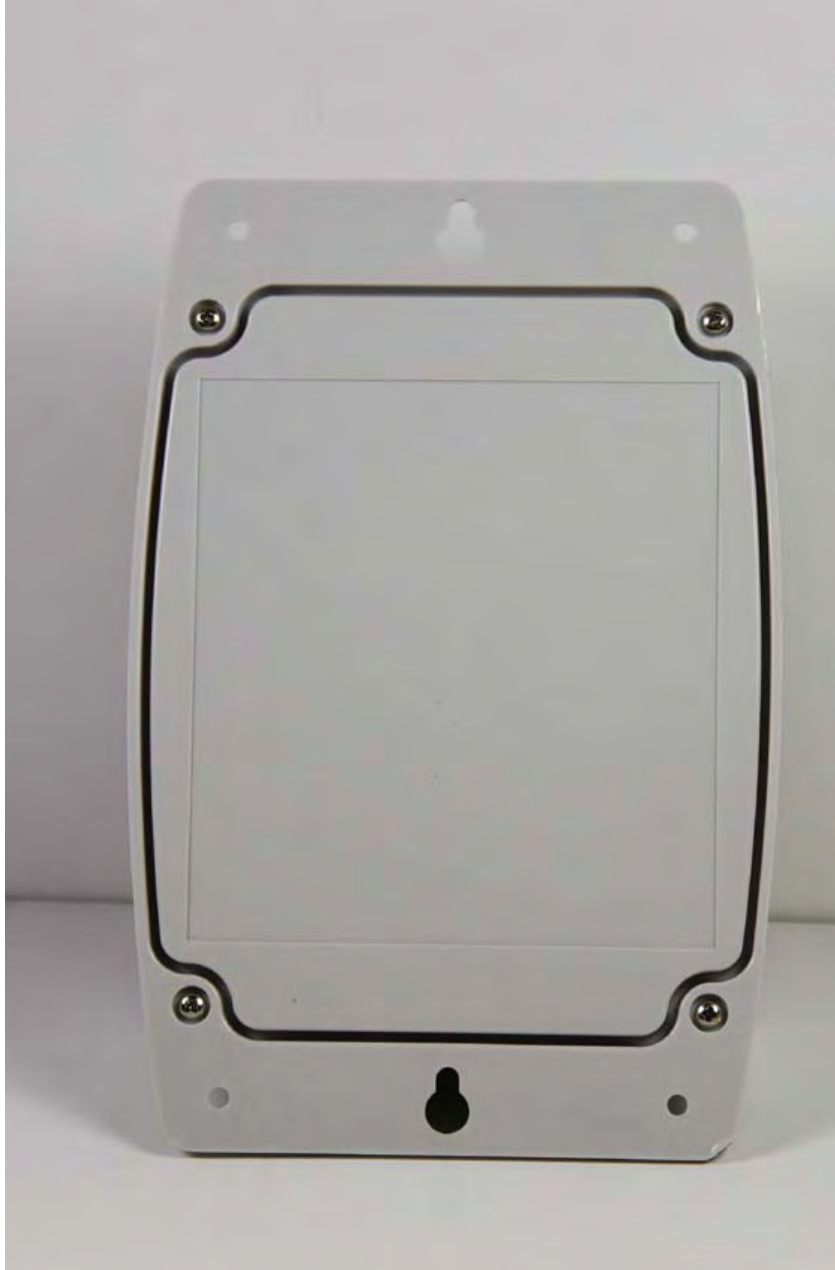
EXHIBIT: RQA-451 and RQT-451 back view FCC ID: AIERIT32-451