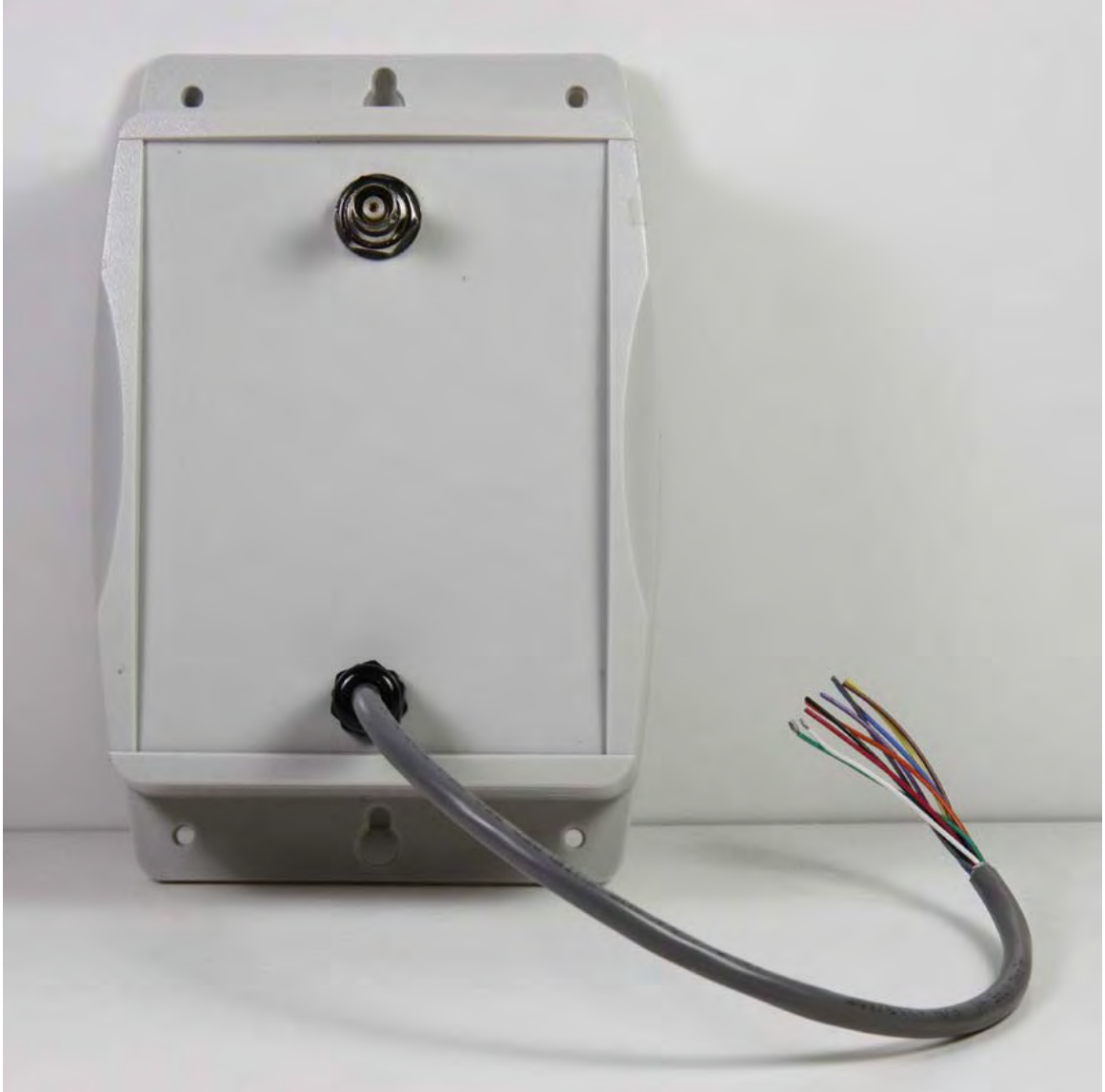
EXHIBIT: RQT-451 front view with no label (front panel label included as separate exhibit)