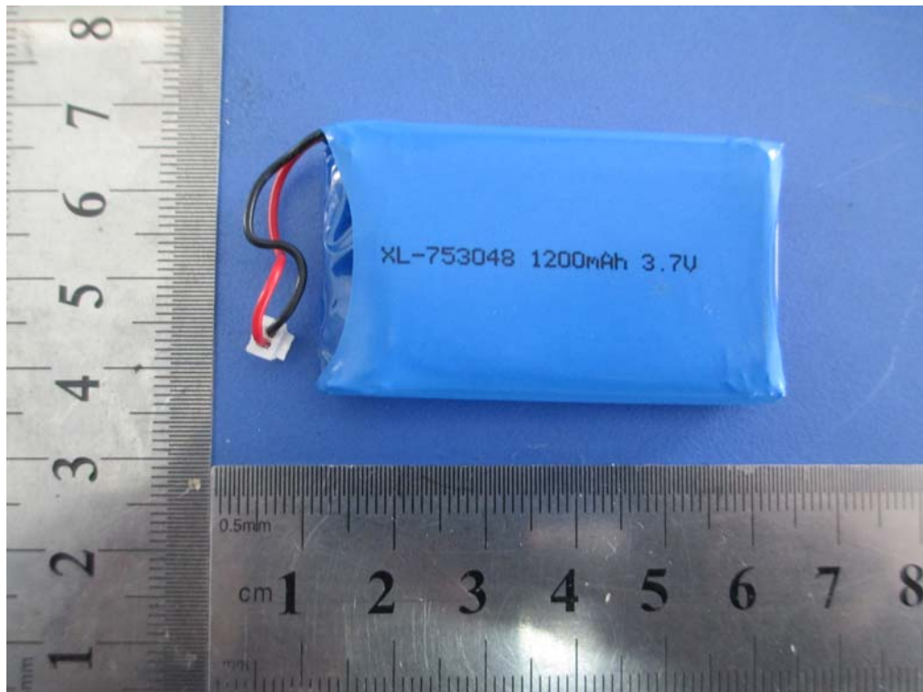
EUT Battery - Top View