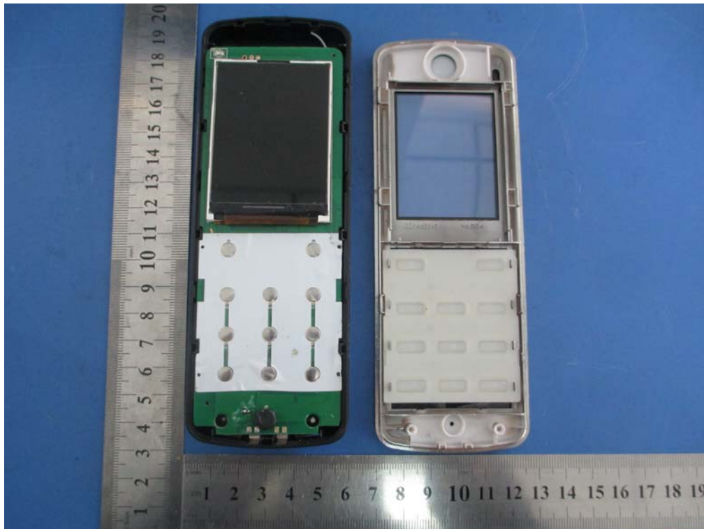
Cover Off - Top View 1