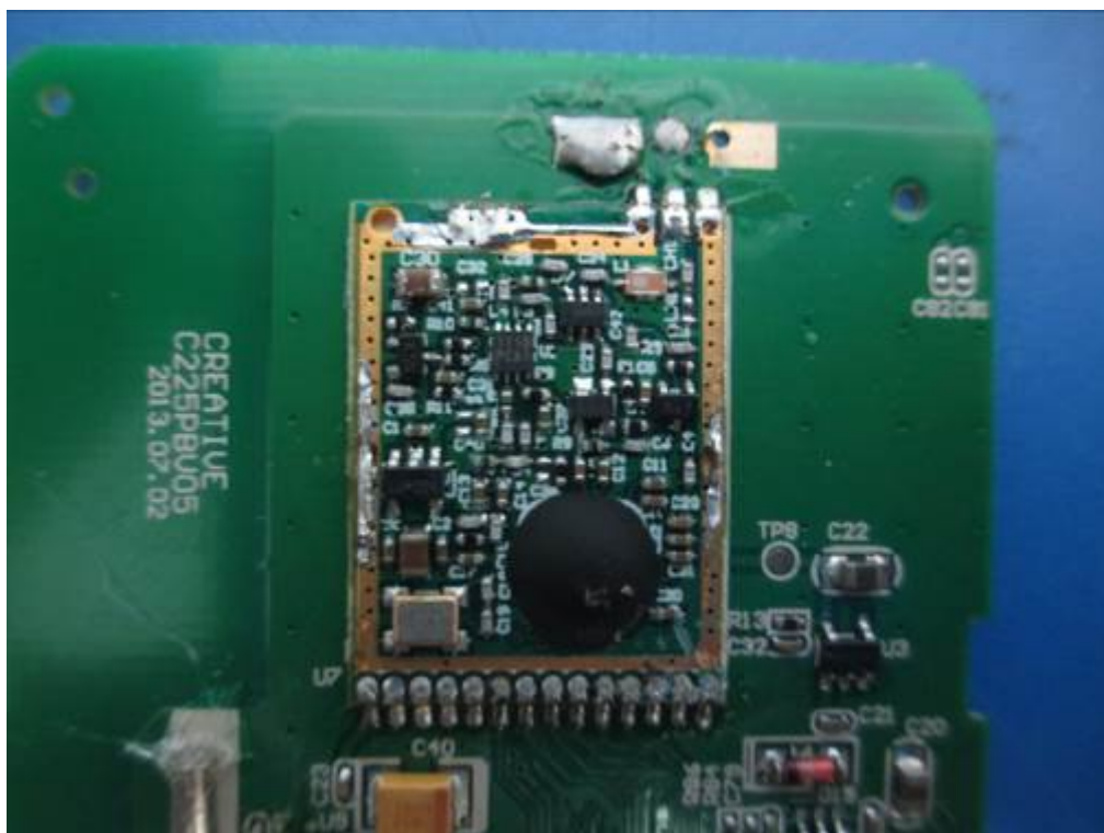
Antenn PCB - Top View