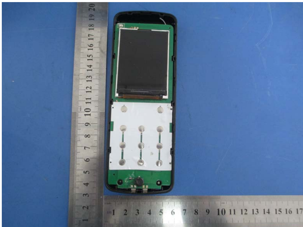
Cover Off - Top View 2