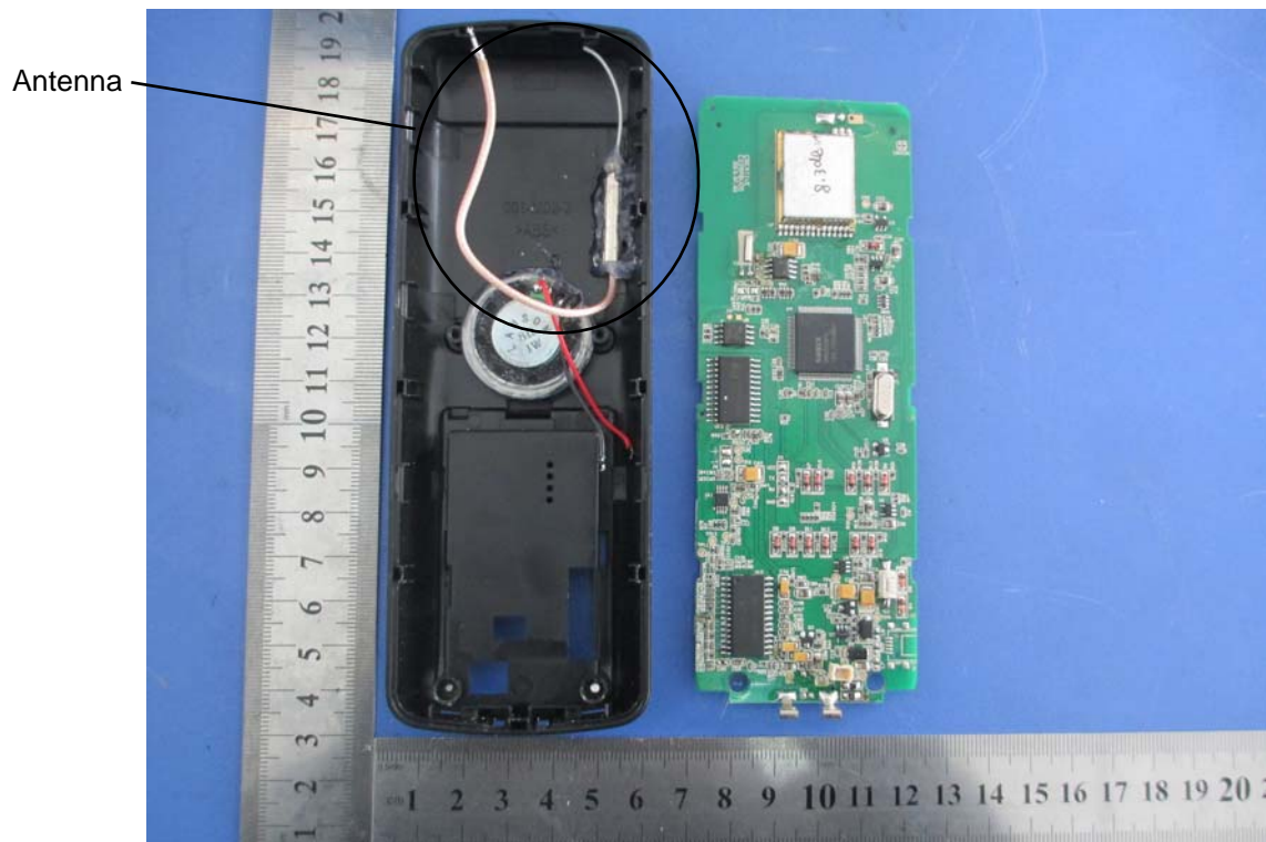
Cover Off - Bottom View