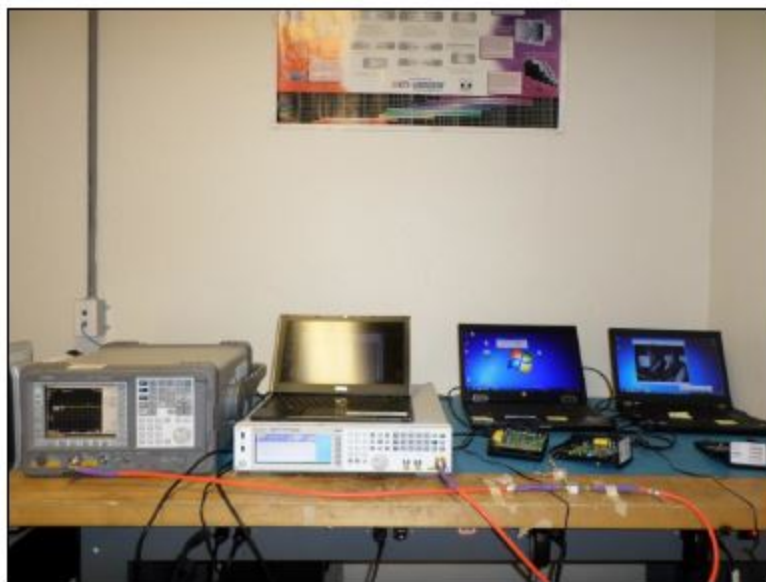
Photograph 2. DFS Test Setup