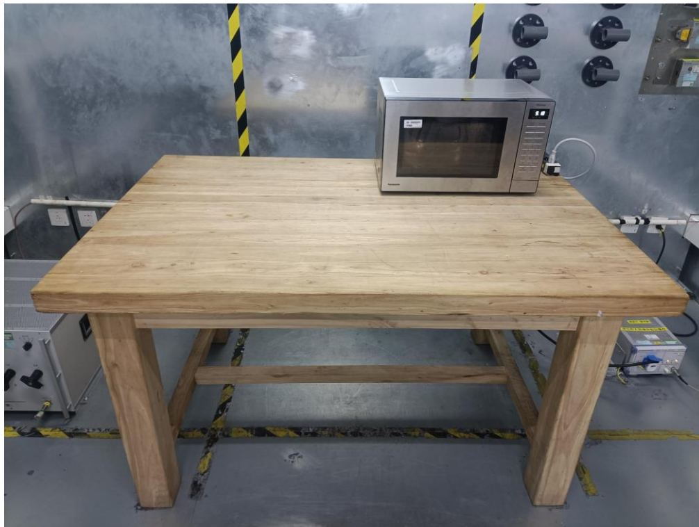
AC Power Line Conducted Emissions