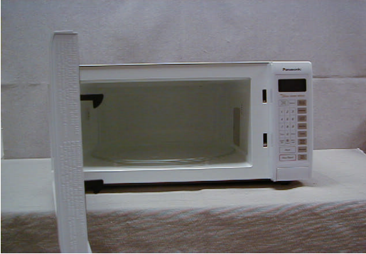
Exhibit: B1 NN-H765 Front view, Door Open