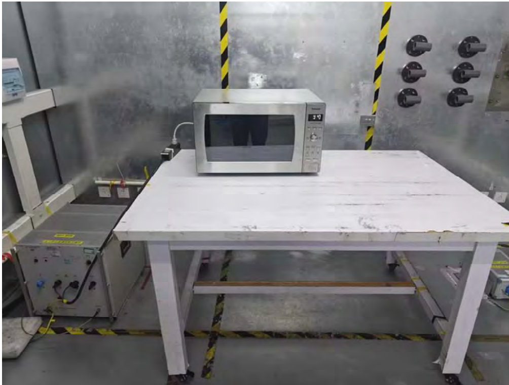
AC Power Line Conducted Emissions