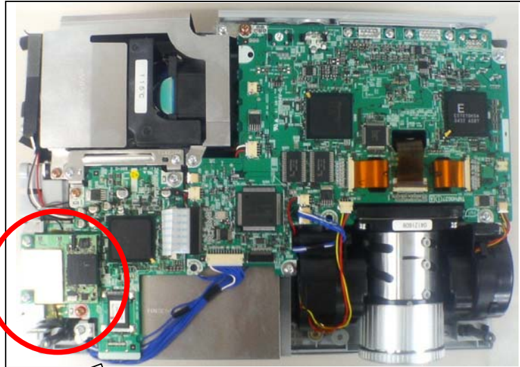
LCD Projector Body