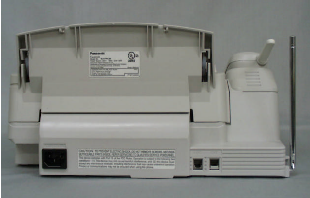
FIG. 2 : REAR VIEW