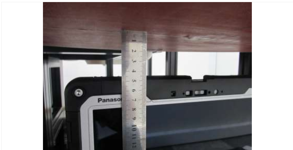
Distance of 45 mm from the EUT