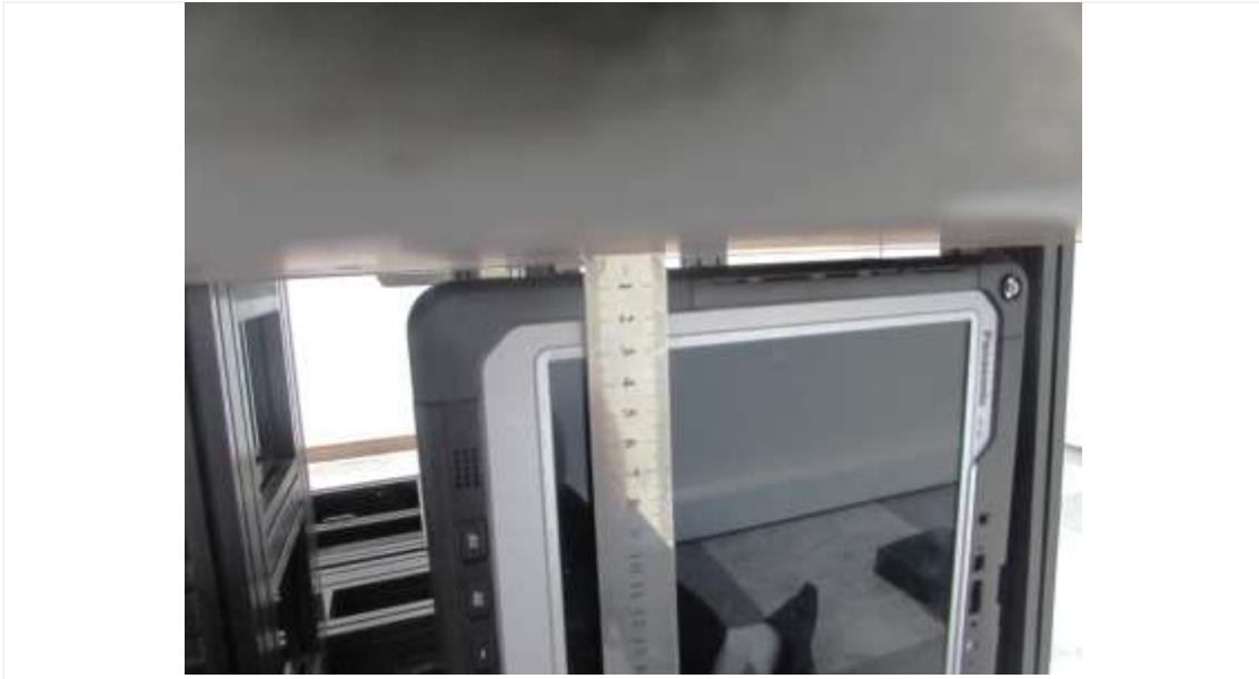
Distance of 5 mm from the EUT