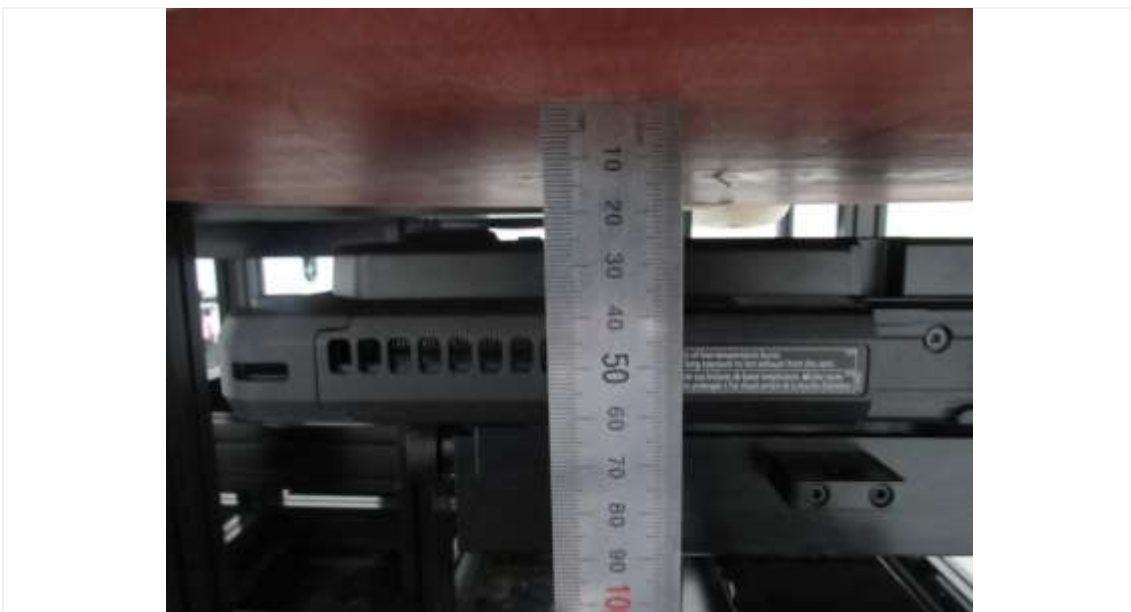
Distance of 25 mm from the EUT