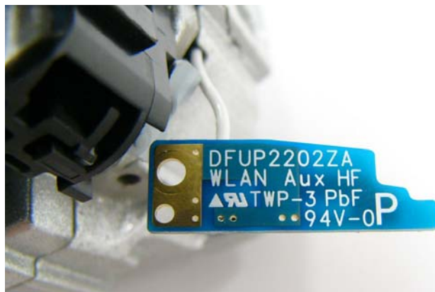
WLAN Aux & Bluetooth TX/RX Antenna