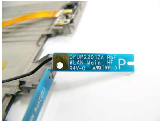
WLAN Main TX/RX Antenna