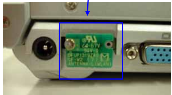
RX Antenna Magnified View