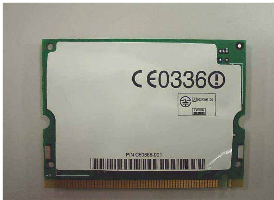
WLAN Bottom View