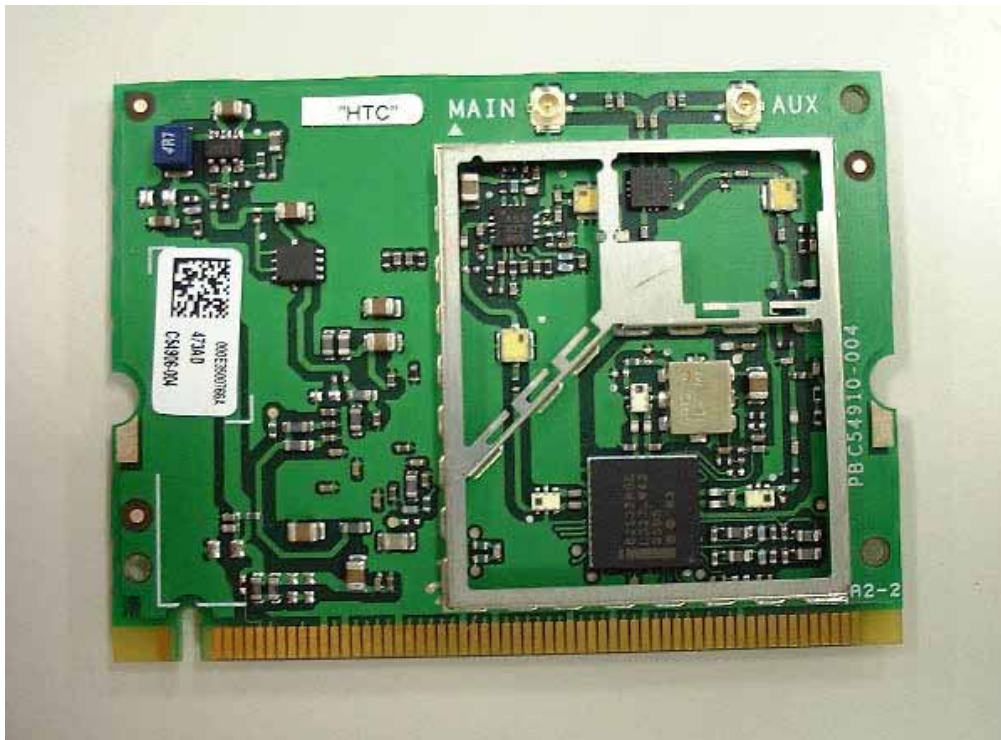
WLAN inside Top View