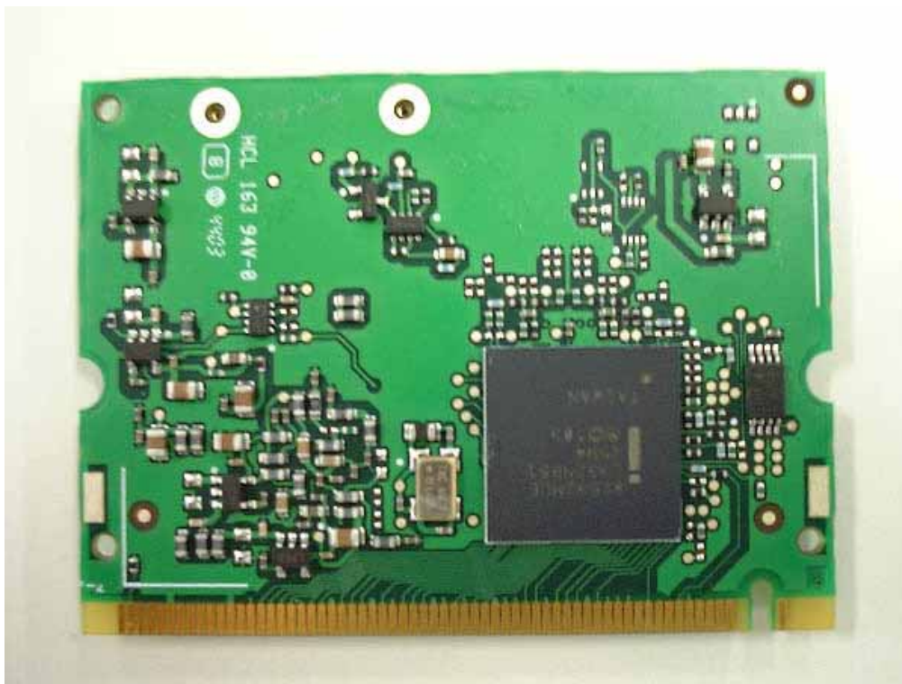
WLAN inside Bottom View