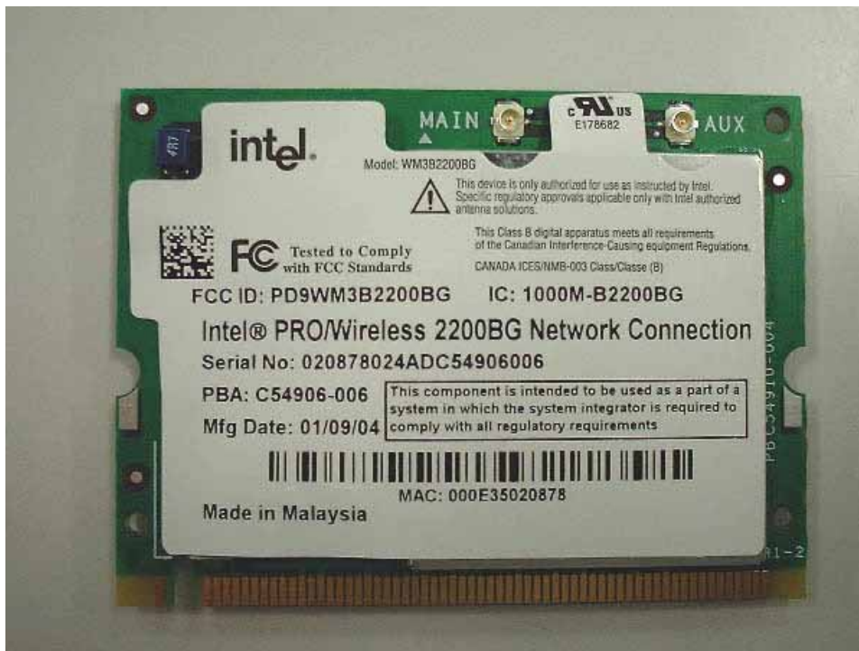
WLAN Top View