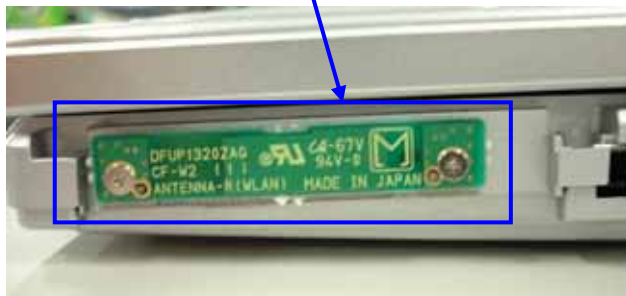
TX Antenna Magnified View