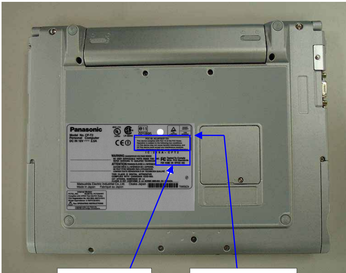
Rating Plate (FCC DoC Position)