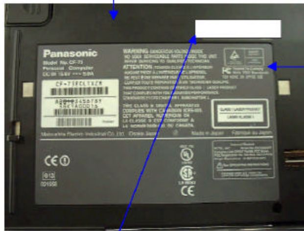
FCC ID LABEL