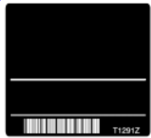
FCC ID Label

For the U.S. only / Pour les États-Unis seulement FCC ID: ACJ9F0CF-625 This device complies with Part 15 of the FCC Rules. Operator is subject to the following two conditions: (1) This device may not cause harmful interference, and (2) This device must accept any interference received, including interference that may cause undesired operation. RC216A-CF52