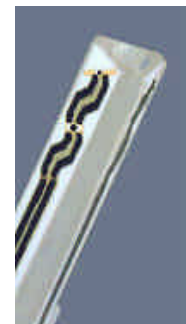
Figure 3.2 Probe Thick-Film Technique