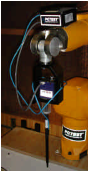
Figure 3.1 DAE System

The SAR measurements were conducted with the dosimetric probe ET3DV6, designed in the classical triangular configuration [7] (see Fig. 3.2) and optimized for dosimetric evaluation. The probe is constructed using the thick film technique; with printed resistive lines on ceramic substrates. The probe is equipped with an optical multifiber line ending at the front of the probe tip (see Fig. 3.3). It is connected to the EOC box on the robot arm and provides an automatic detection of the phantom surface. Half of the fibers are connected to a pulsed infrared transmitter, the other half to a synchronized receiver. As the probe approaches the surface, the reflection from the surface produces a coupling from the transmitting to the receiving fibers. This reflection increases first during the approach, reaches maximum and then decreases. If the probe is flatly touching the surface, the coupling is zero. The distance of the coupling maximum to the surface is independent of the surface reflectivity and largely independent of the surface to probe angle. The DASY4 software reads the reflection during a software approach and looks for the maximum using a 2 nd order fitting (see Fig.3.1). The approach is stopped at reaching the maximum.