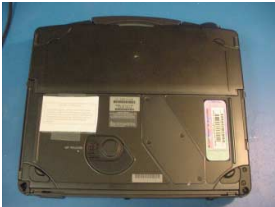
PHOTOGRAPH 2: LABEL LOCATION