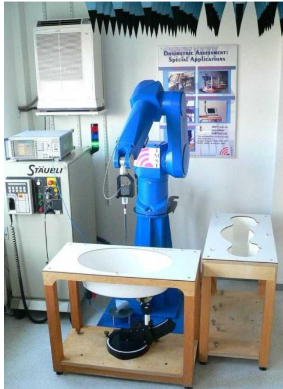
Fig. 3: The measurement set-up with a DASY system.

The DUT operating at the maximum power level is placed by a non-metallic device holder (delivered from Schmid & Partner) in the above described positions at a shell phantom of a human being. The distribution of the electric field strength E is measured in the tissue simulating liquid within the shell phantom. For this miniaturised field probes with high sensitivity and low field disturbance are used. Afterwards the corresponding SAR values are calculated with the known electrical conductivity \sigma and the mass density \rho of the tissue in the SEMCAD FDTD software. The software is able to determine the averaged SAR values (averaging region 1 g or 10 g) for compliance testing.