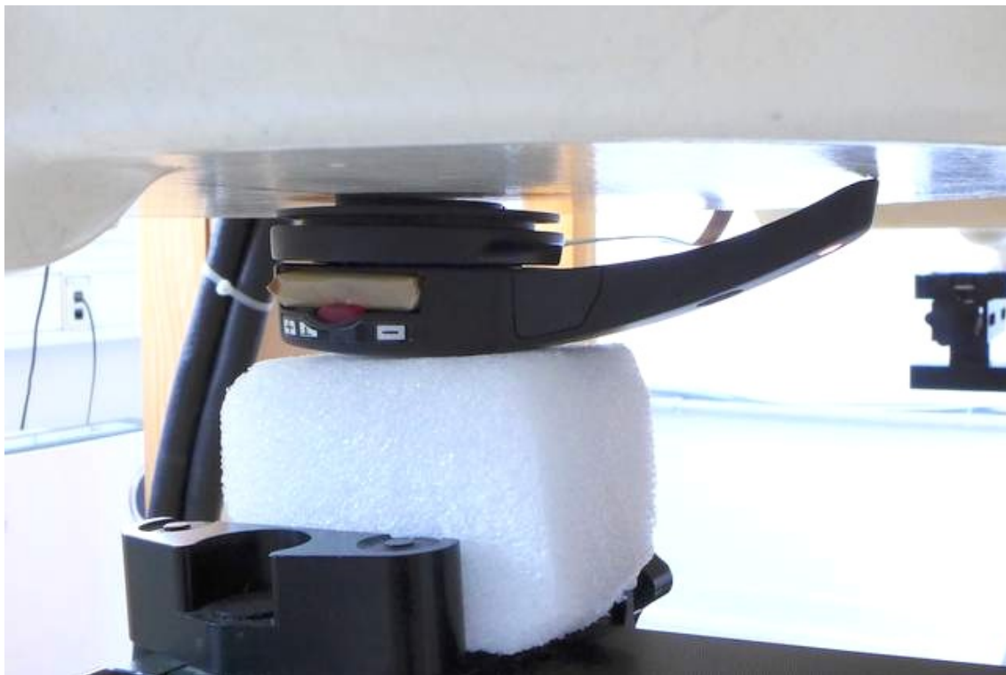
Pic. 3: Test position – inner side, 0mm distance to phantom.