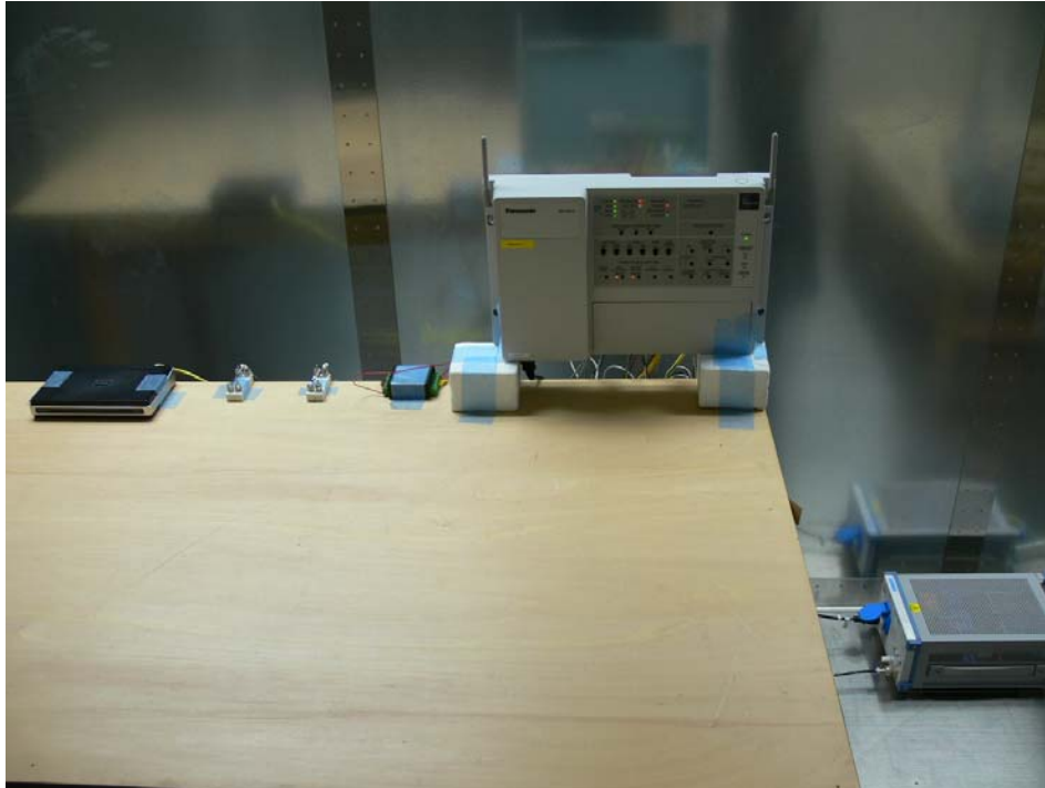
Photograph 1: Set-up for Front View Conducted Testing