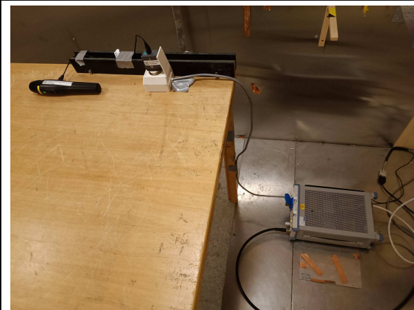
Power-Line Conducted Emissions