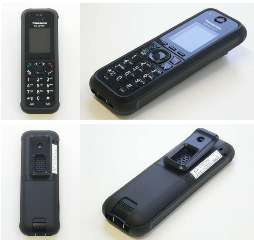
Fig. 14: Pictures of the device under test.