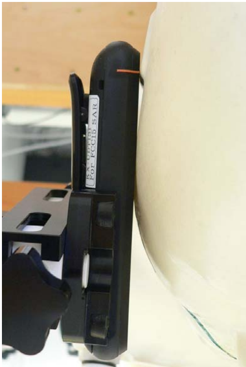
Fig. 17: Cheek position, right side.