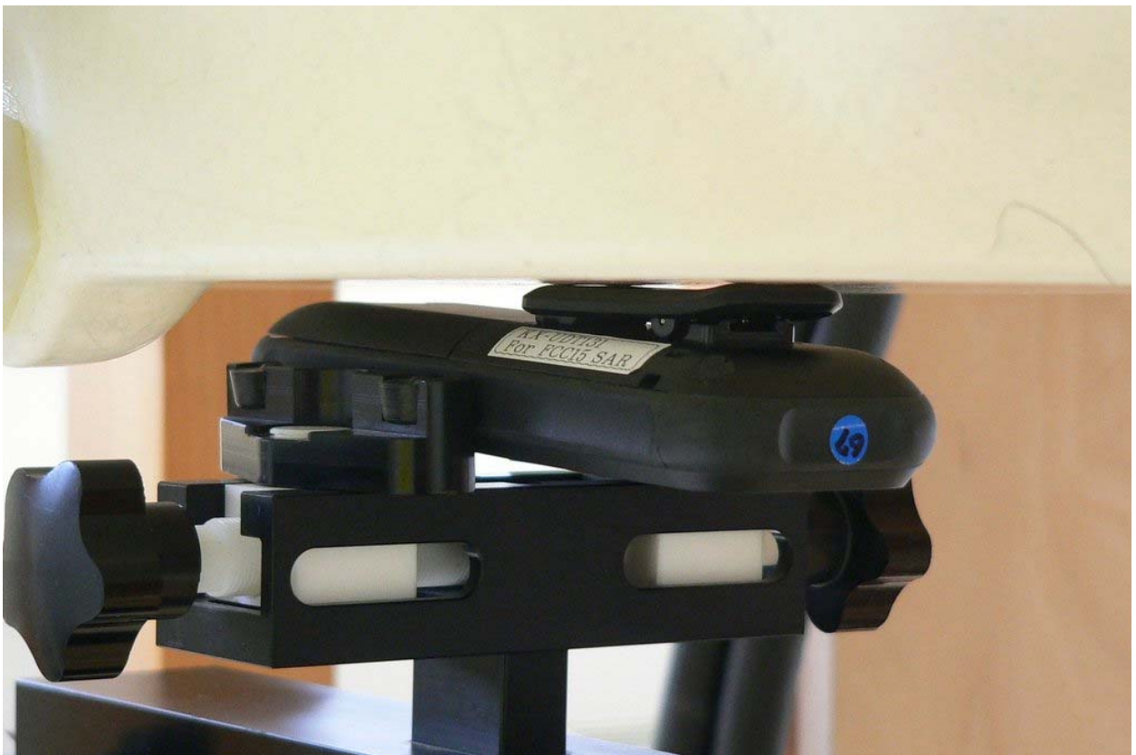
Fig.20: Body worn configuration for KX-UDT131, position 2, display towards the ground, 0 mm distance.