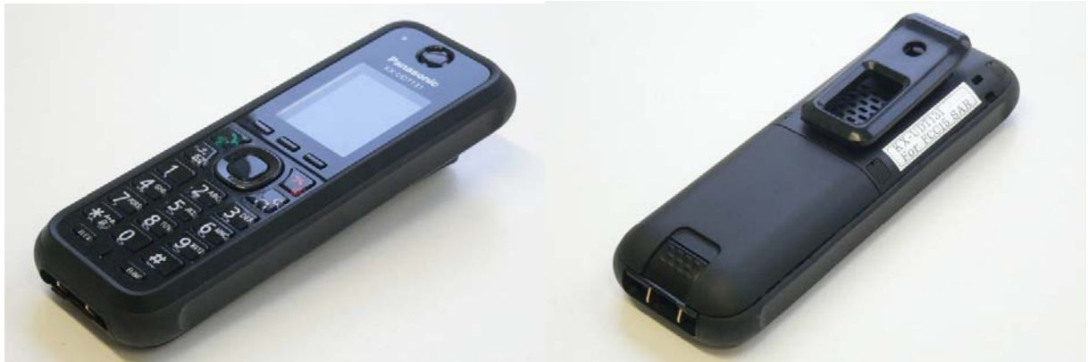
Fig. 1: Pictures of the device under test.