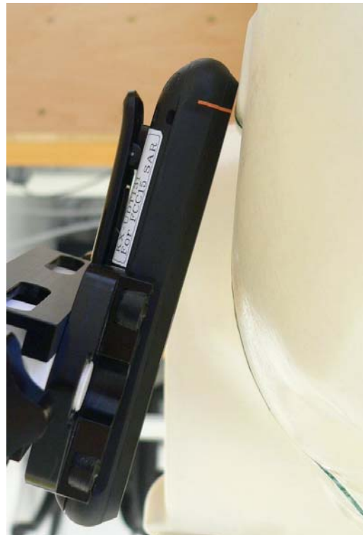
Fig. 18: Tilted position, right side.