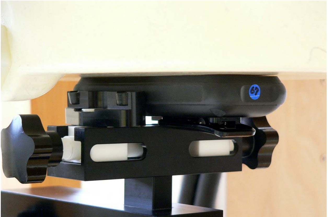
Fig.19: Body worn configuration for KX-UDT131, position 1, display towards the phantom, 0 mm distance.