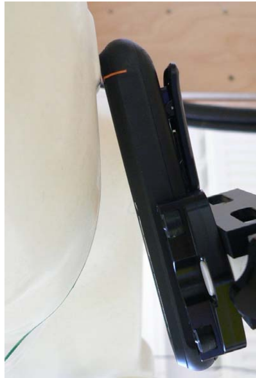
Fig. 16: Tilted position, left side.