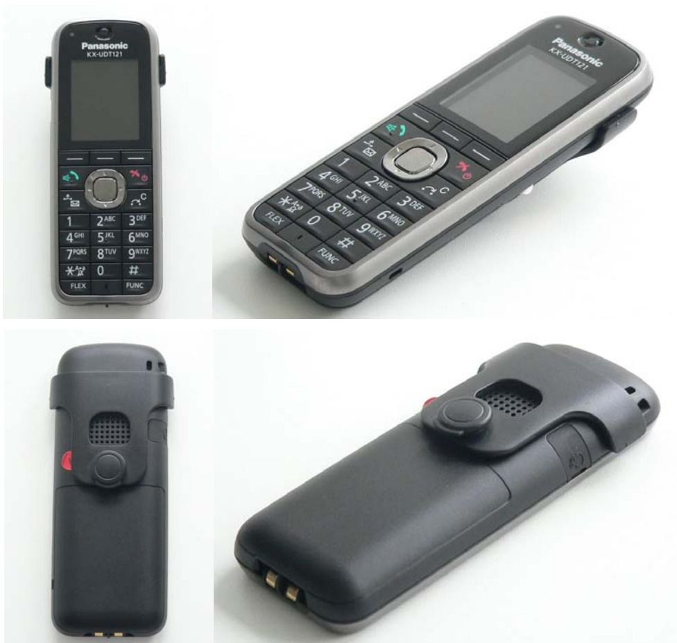
Fig. 2: Pictures of the device under test.

Figure 14 - 15 show the device under test and the used accessory.