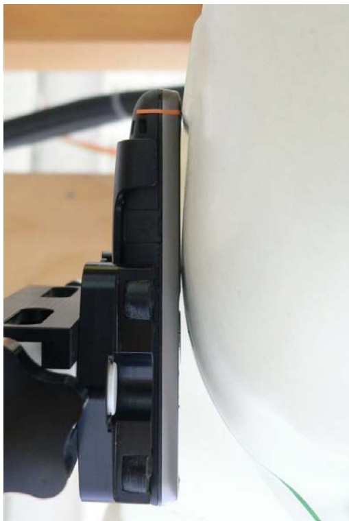
Fig. 6: Cheek position, right side.