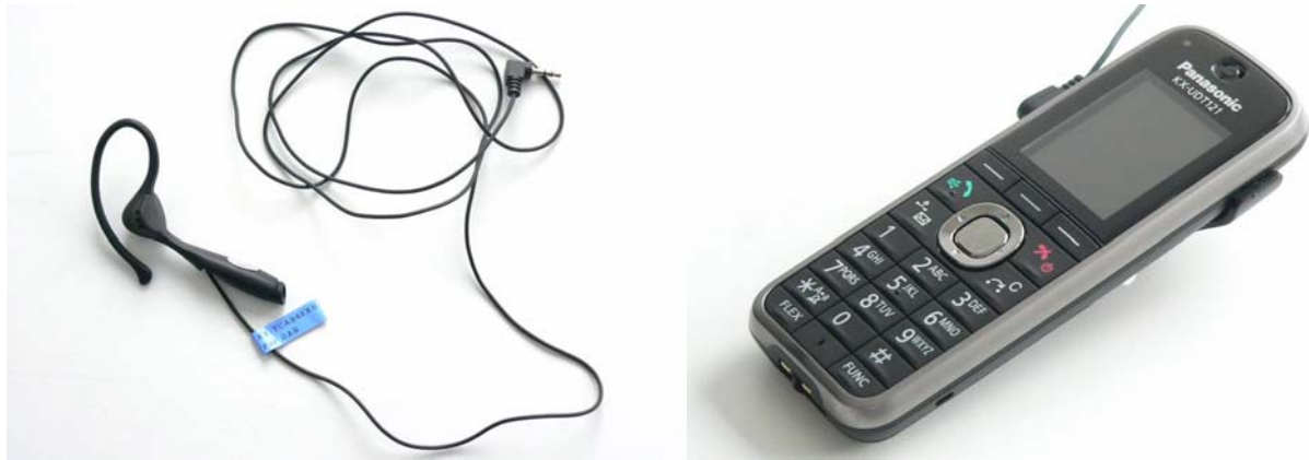
Fig. 3: Pictures of the used headset.