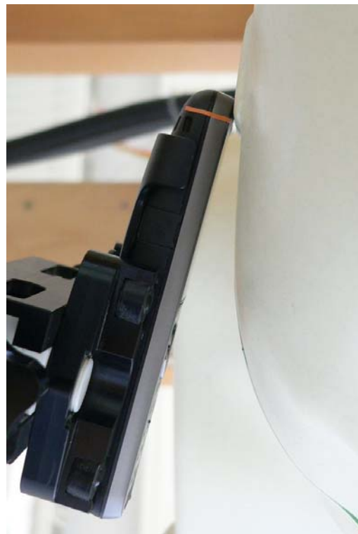
Fig. 7: Tilted position, right side.