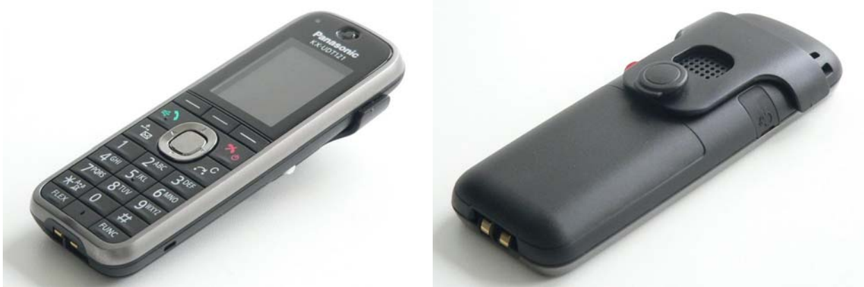
Fig. 1: Pictures of the device under test.