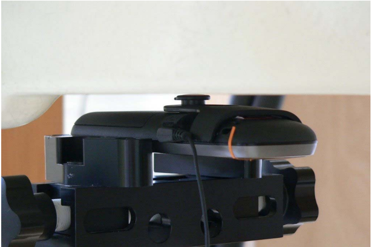
Fig. 9: Body worn configuration for KX-UDT121, position 2, display towards the ground, headset attached, 0 mm distance.