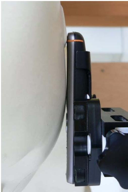
Fig. 4: Cheek position, left side.

Figure 16 - 21 show the test positions for the SAR measurements.