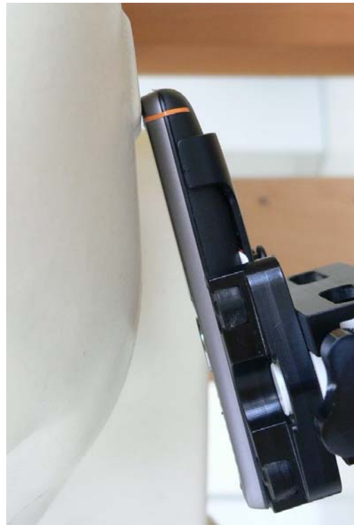
Fig. 5: Tilted position, left side.