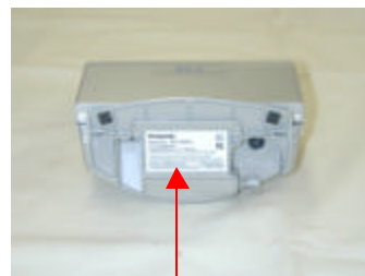
FCC ID Label

Above markings are shown on bottom of the unit.