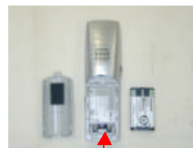
FCC ID Label

The marking will be shown on the battery compartment of the portable unit.