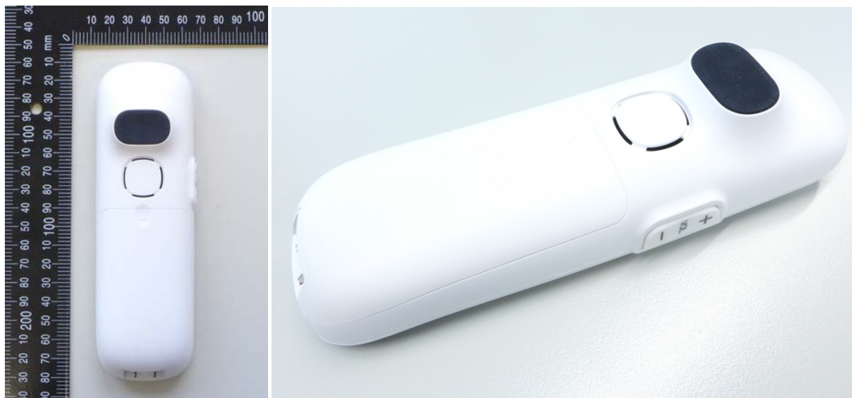
Fig. 12: Pictures of the back side of device under test.