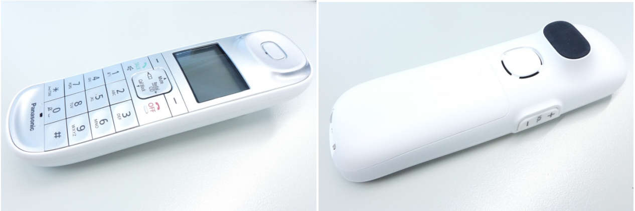
Fig. 1: Pictures of the device under test.