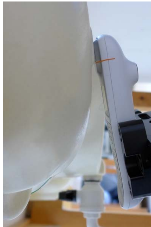
Fig. 14: Tilted position, left side.