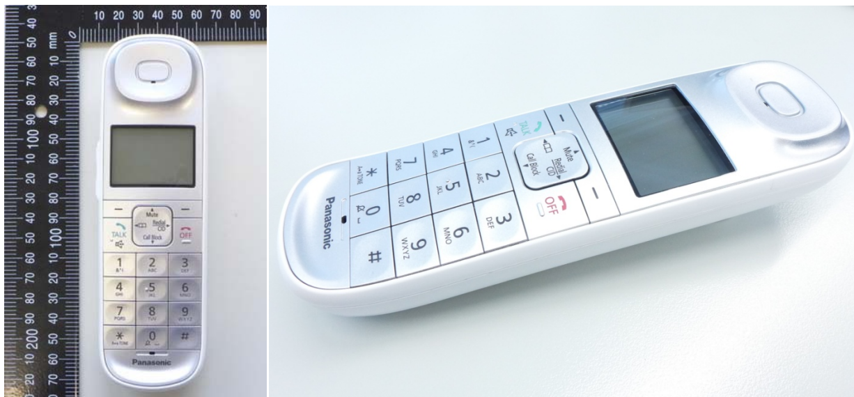
Fig. 11: Pictures of the front side of device under test.

Figure 11 - 12 show the device under test and the used accessory.