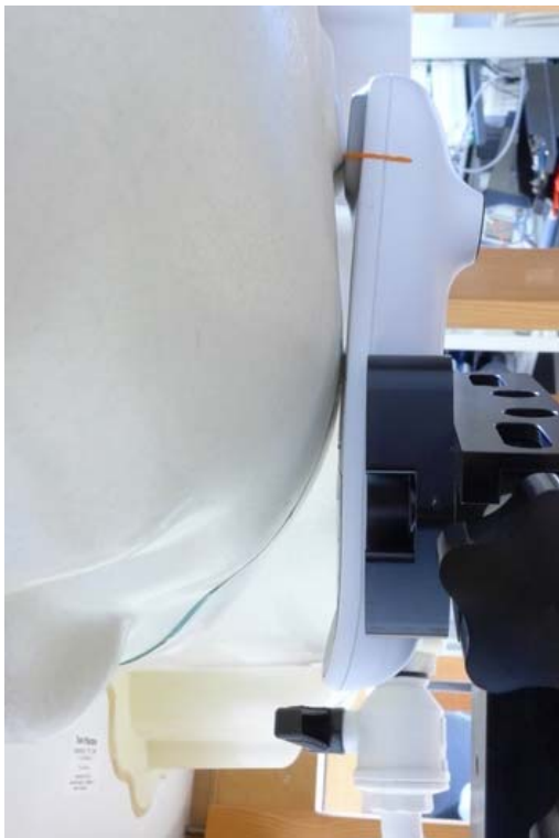
Fig. 13: Cheek position, left side.

Figure 13 - 16 show the test positions for the SAR measurements.