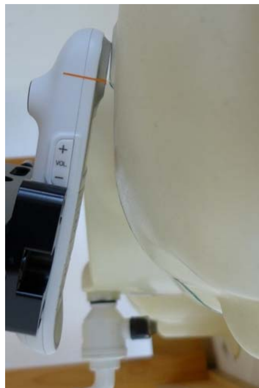
Fig. 16: Tilted position, right side.