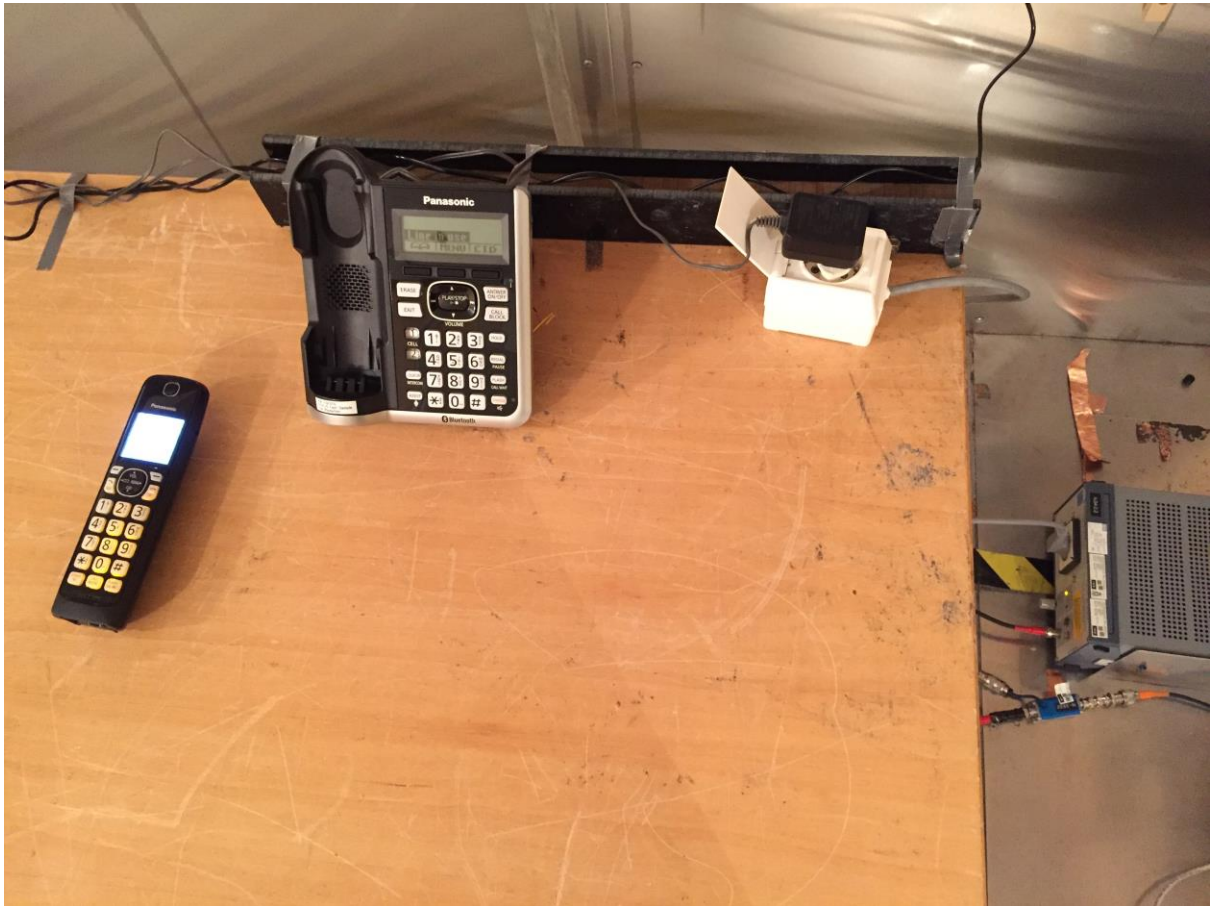
Power line Conducted Emissions Test