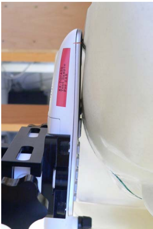
Fig. 14: Cheek position, right side.