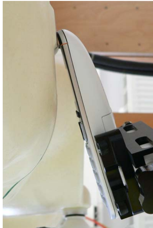
Fig. 13: Tilted position, left side.