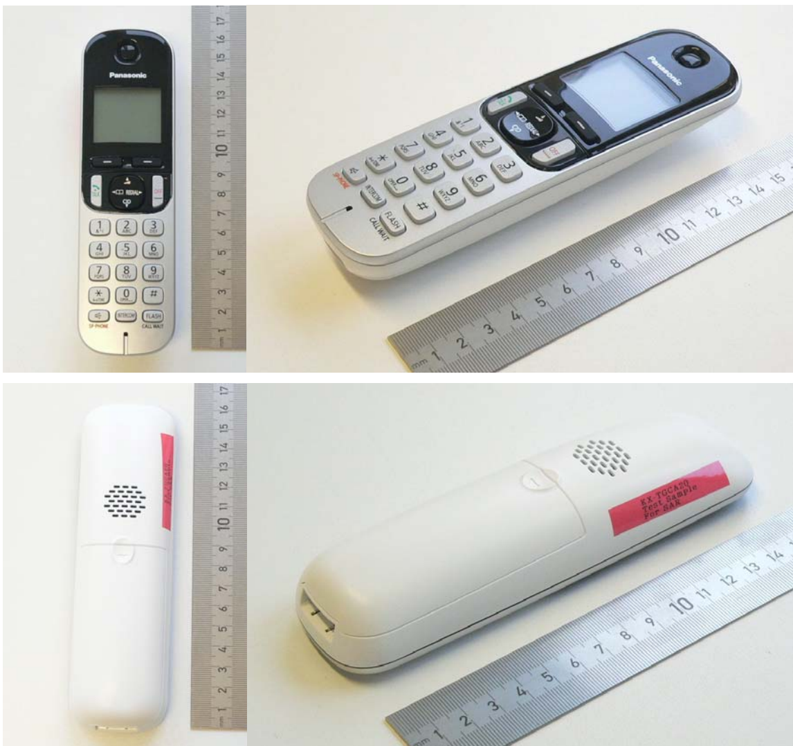
Fig. 11: Pictures of the device under test.