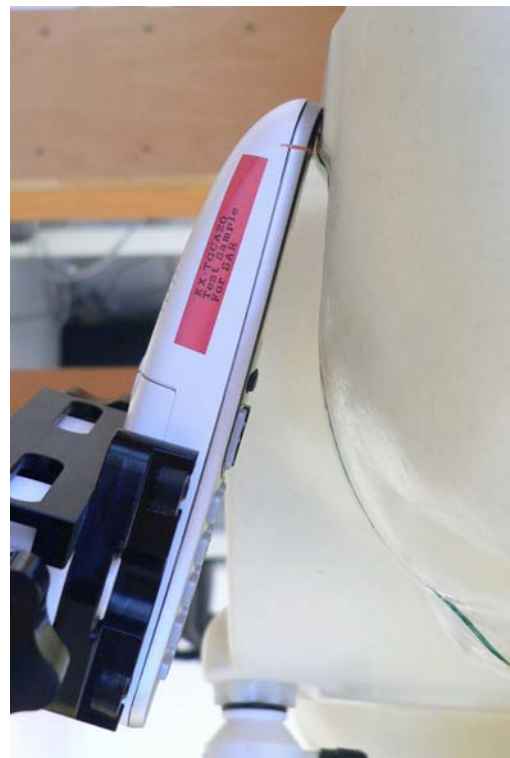
Fig. 15: Tilted position, right side.