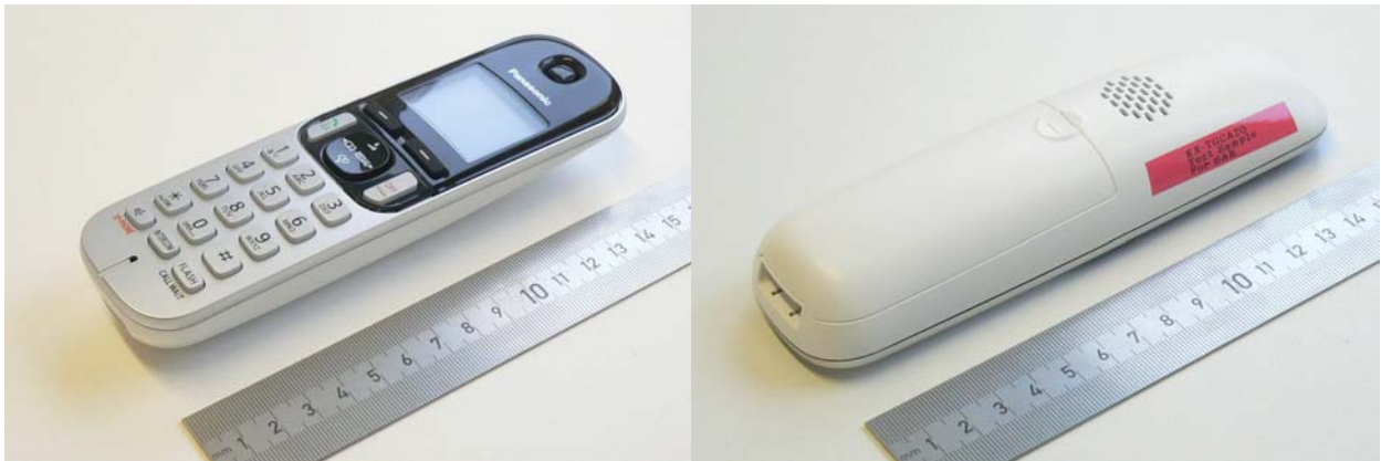
Fig. 1: Pictures of the device under test.