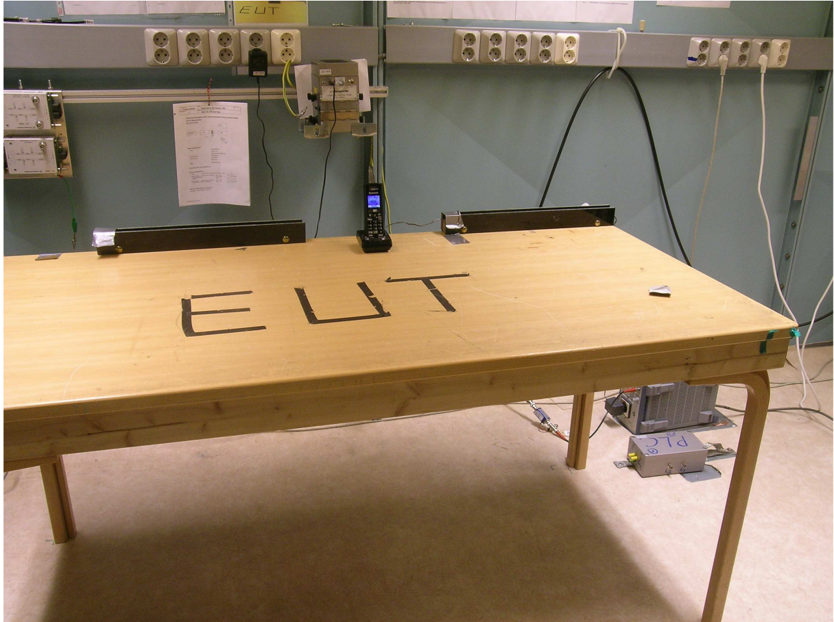
Power-Line Conducted Emissions Test