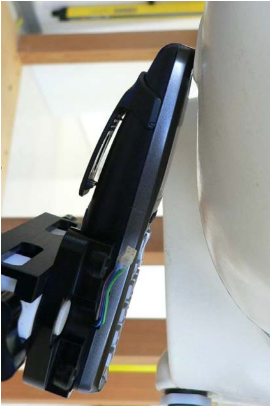
Fig.21: Tilted position, right side.