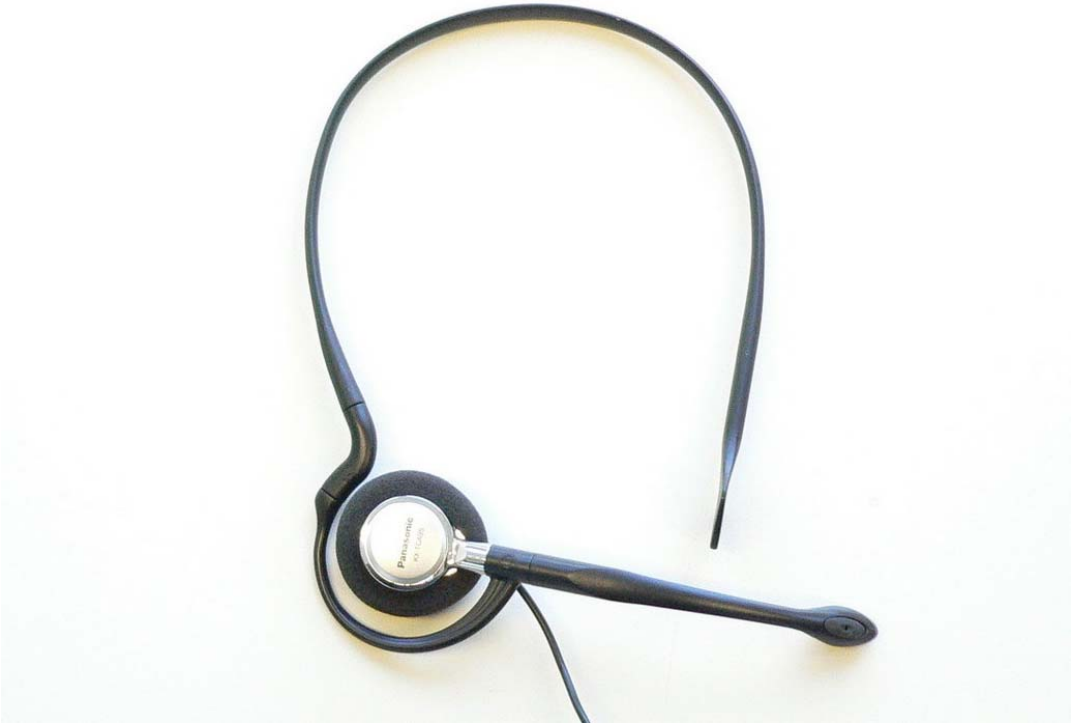
Fig. 17: Used headset, KX-TCA95.