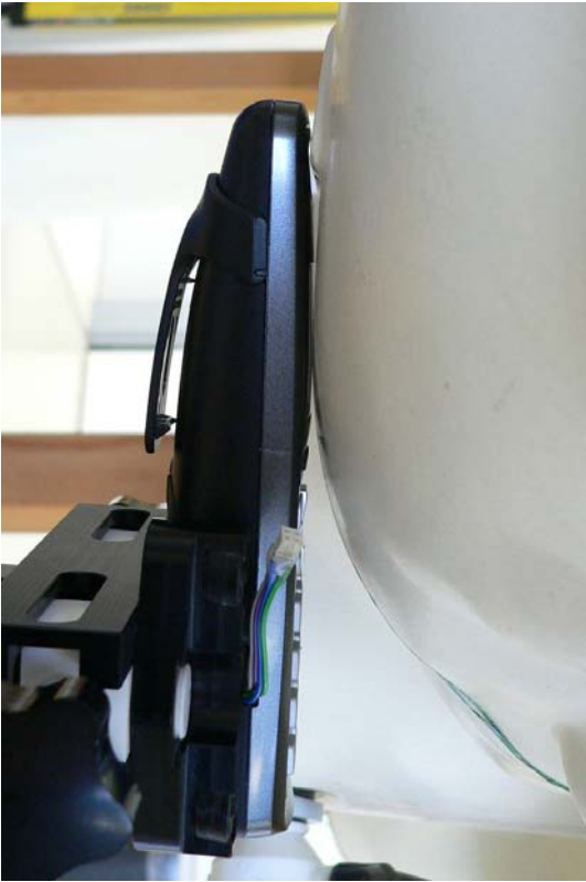
Fig. 20: Cheek position, right side.