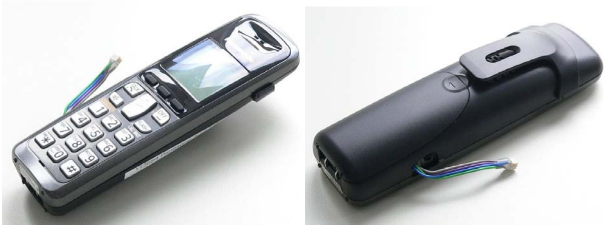
Fig. 1: Pictures of the device under test.