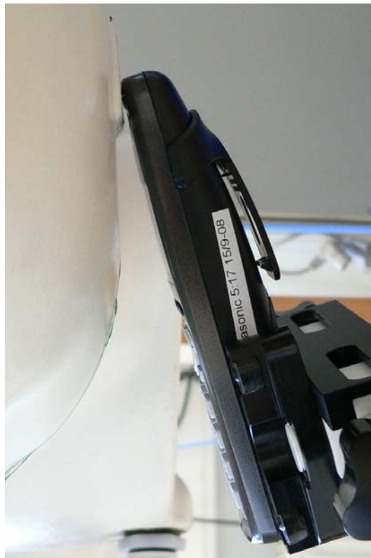
Fig.19: Tilted position, left side.