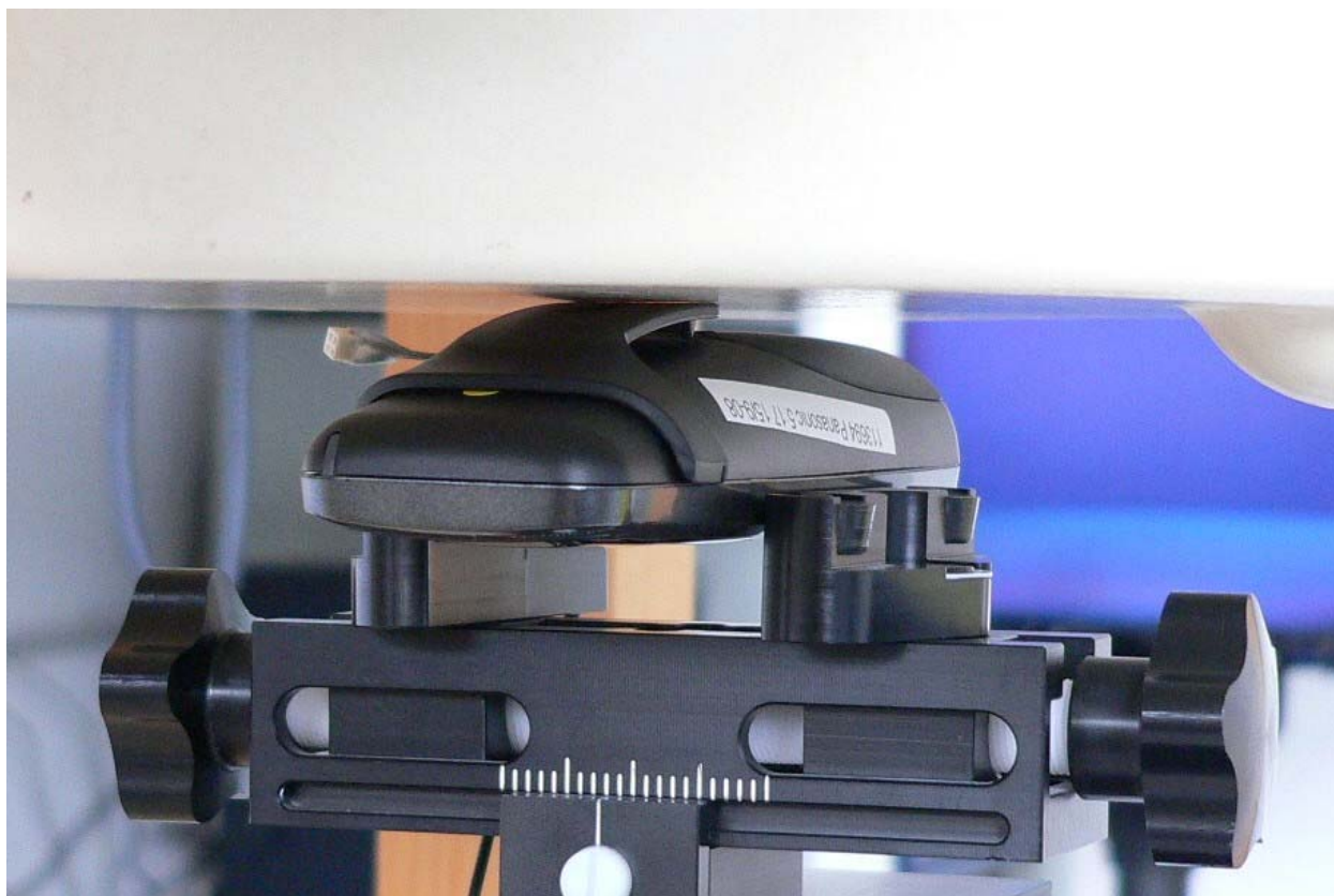
Fig.23: Body worn, antenna 1 or antenna 2, with belt clip and headset, display towards the ground.