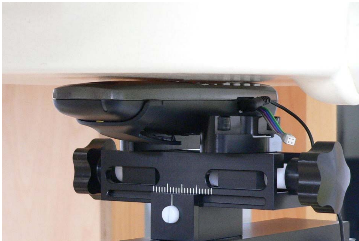
Fig.22: Body worn, antenna 1 or antenna 2, with belt clip and headset, display towards the phantom.