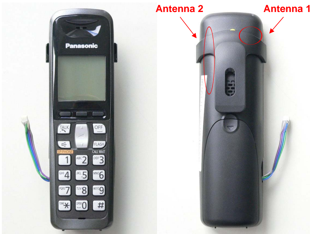
Fig.16: Pictures of the device under test

Fig. 16- 17 show the device under test and the used accessories.