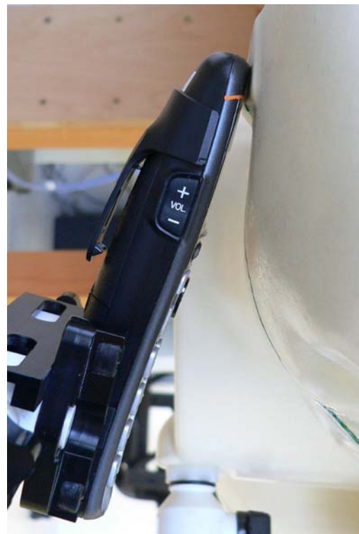
Fig. 19: Tilted position, right side.