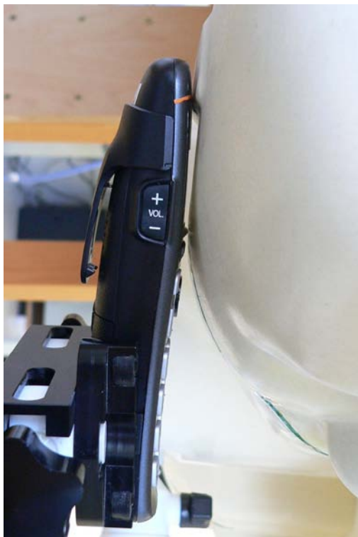
Fig. 18: Cheek position, right side.