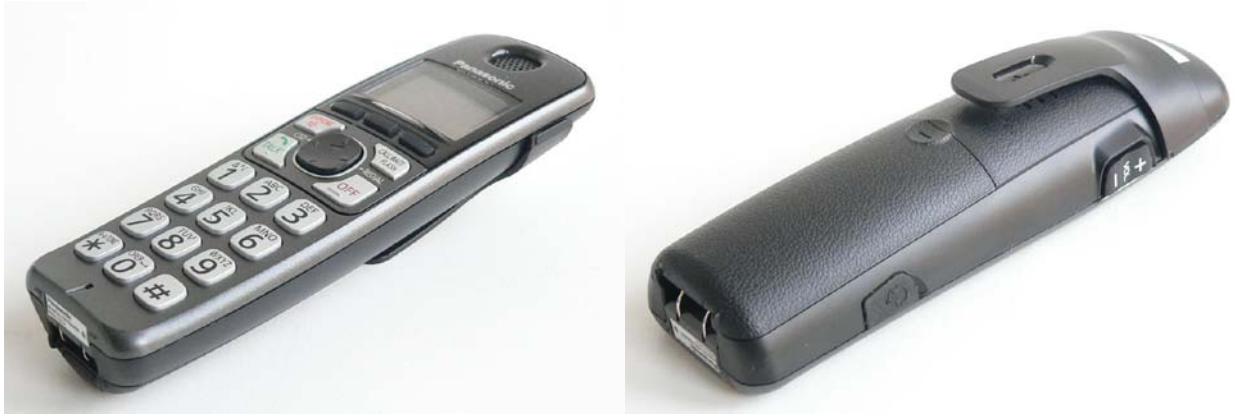
Fig. 1: Pictures of the device under test.