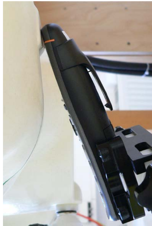
Fig. 17: Tilted position, left side.