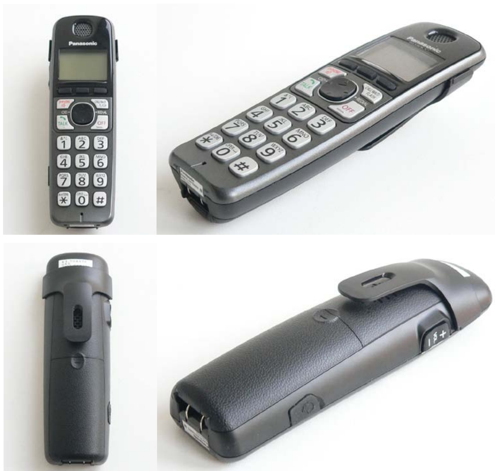
Fig. 14: Pictures of the device under test.

Figure 14 - 15 show the device under test and the used accessory.