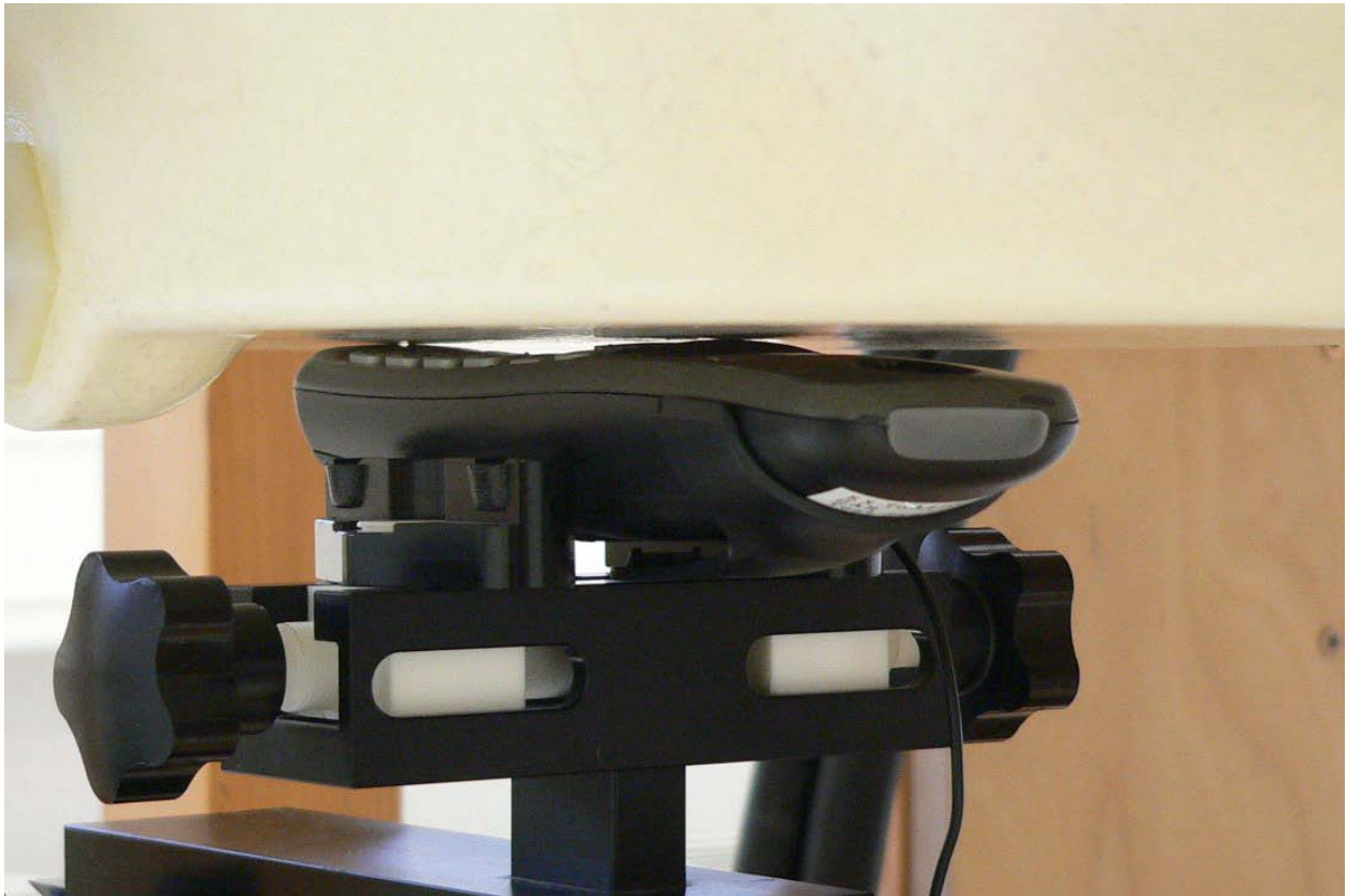
Fig. 20: Body worn configuration KX-TGA470, position 1, display towards the phantom, belt clip and headset attached, 0 mm distance.