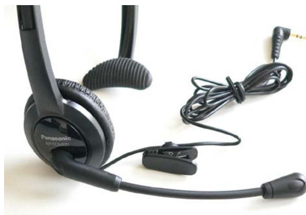
Fig. 15: Pictures of the used headset.