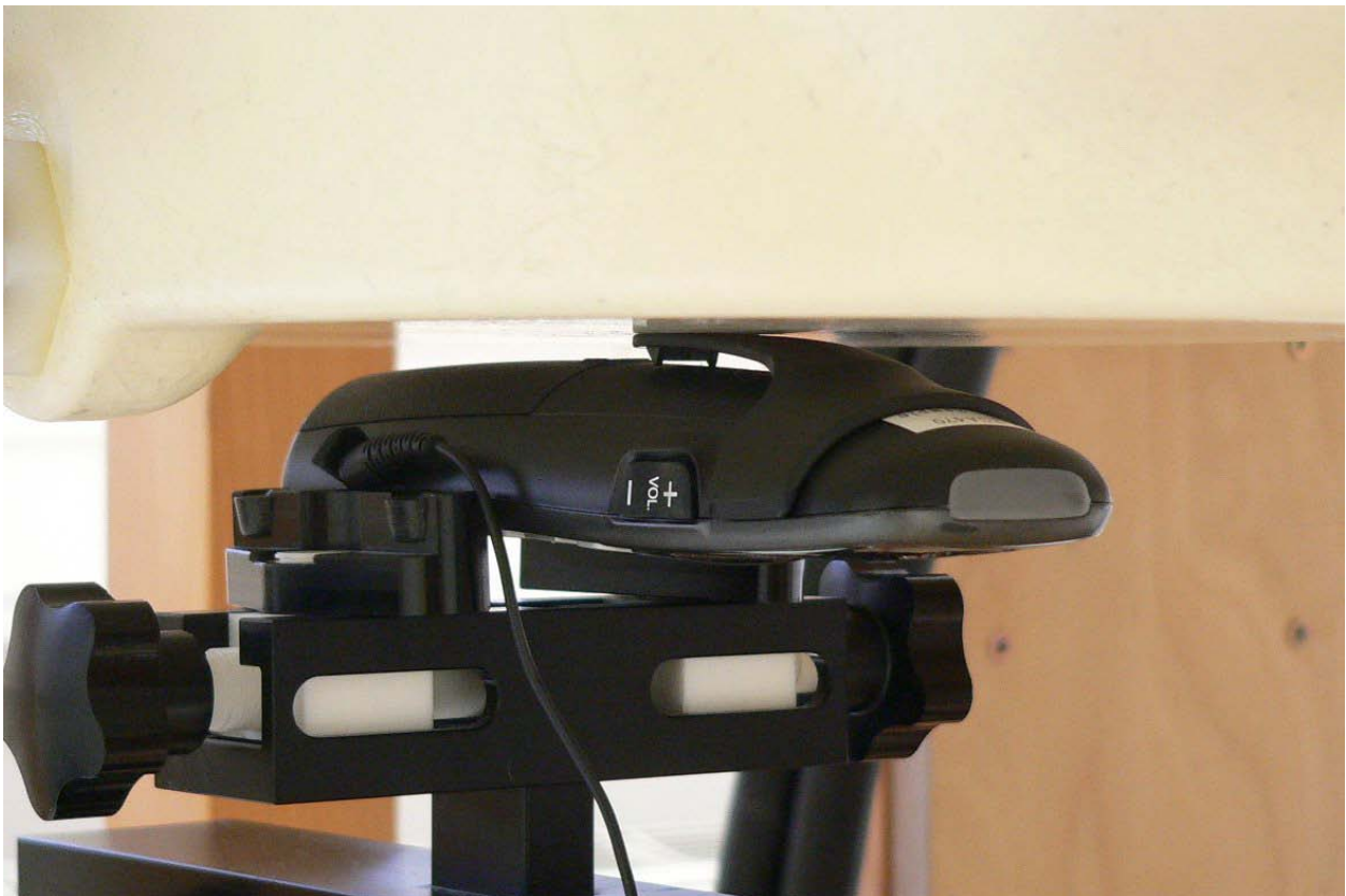
Fig. 21: Body worn configuration KX-TGA470, position 2, display towards the ground, belt clip and headset attached, 0 mm distance.