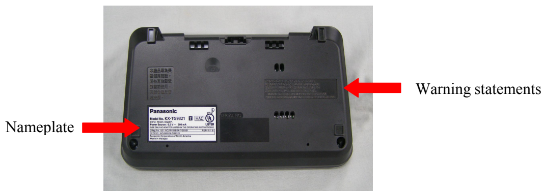
Bottom view of the unit

NOTE: Above markings are shown on bottom of the base unit.