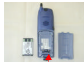
FCC ID Label

The marking will be shown on the battery compartment of the portable unit.