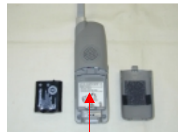
FCC ID Label

The marking will be shown on the battery compartment of the portable unit.