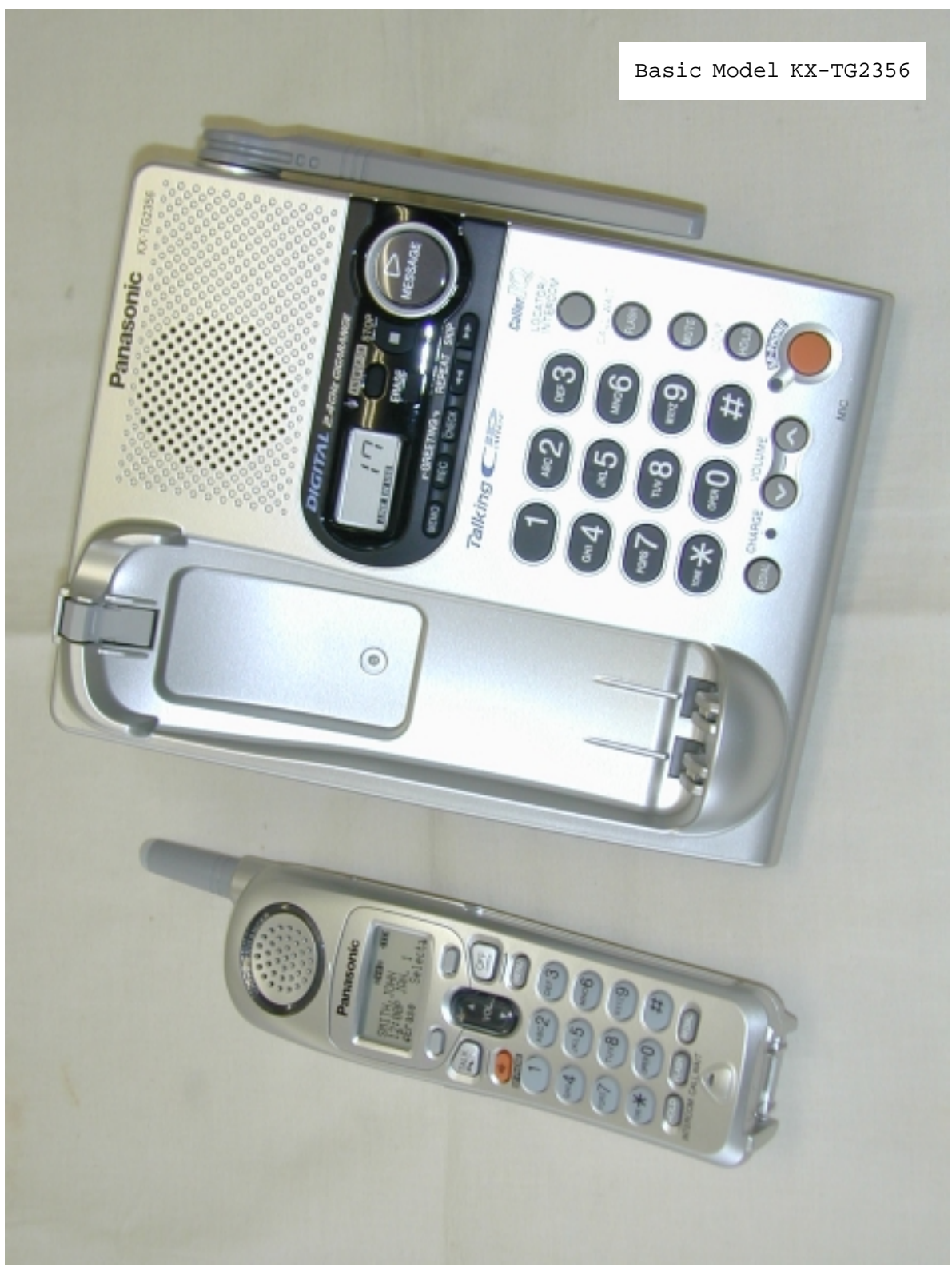
Basic Model KX-TG2356