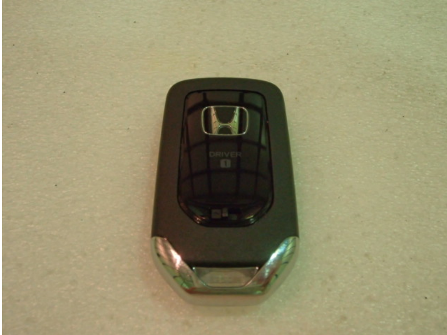
Mechanical Key (Inserted) Worst