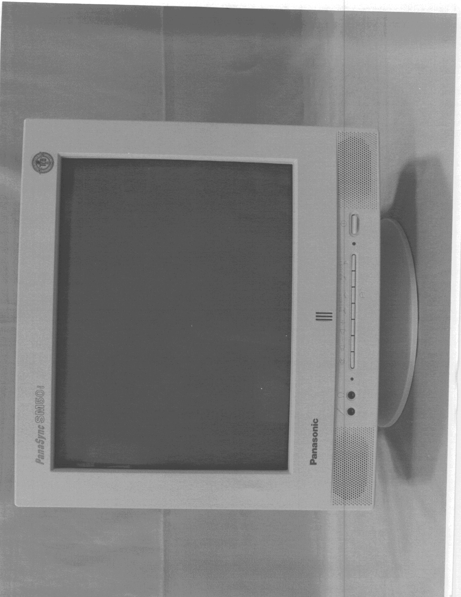
Fig 1. Front View