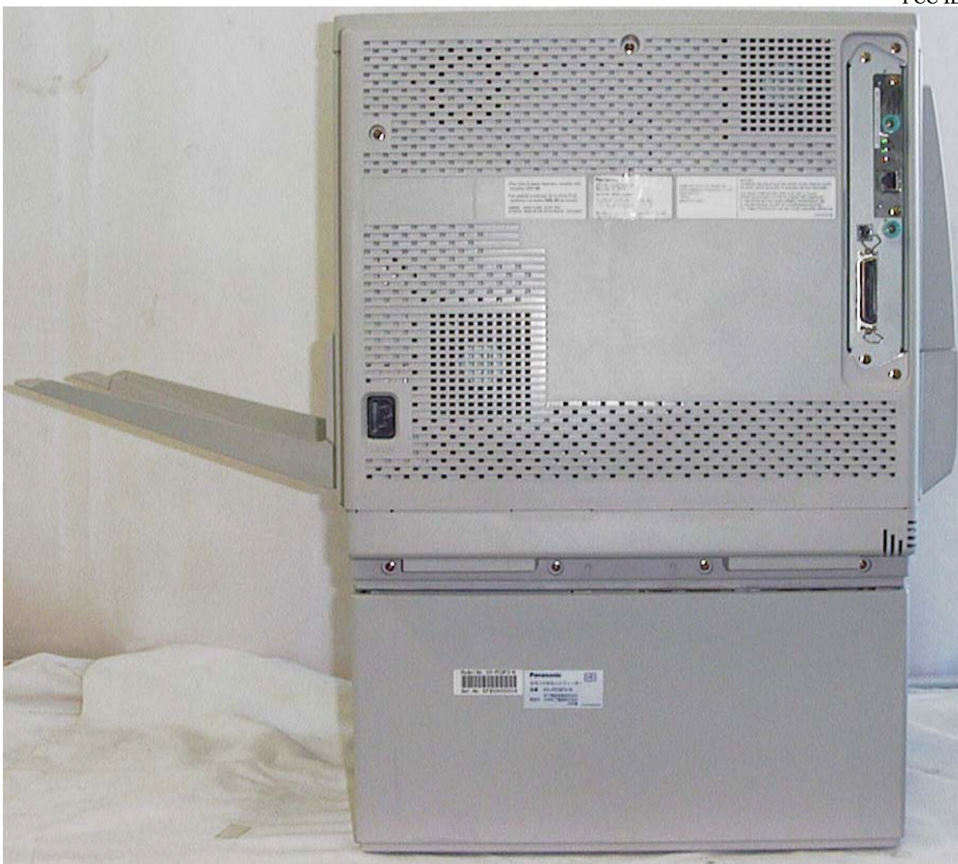
Photo.2 Overall rear view of the EUT