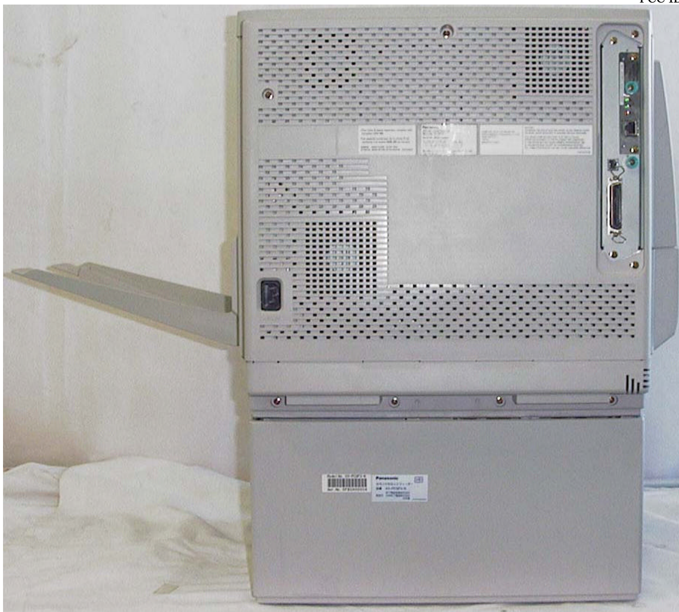
Photo.2 Overall rear view of the EUT