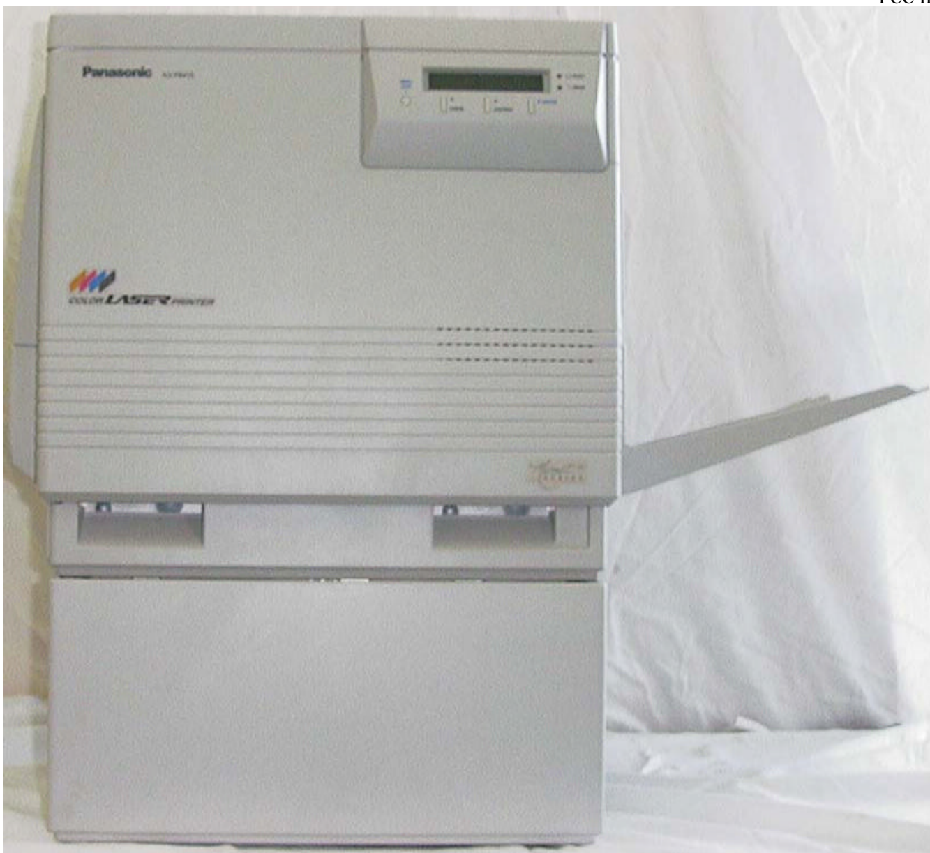
Photo.1 Overall front view of the EUT