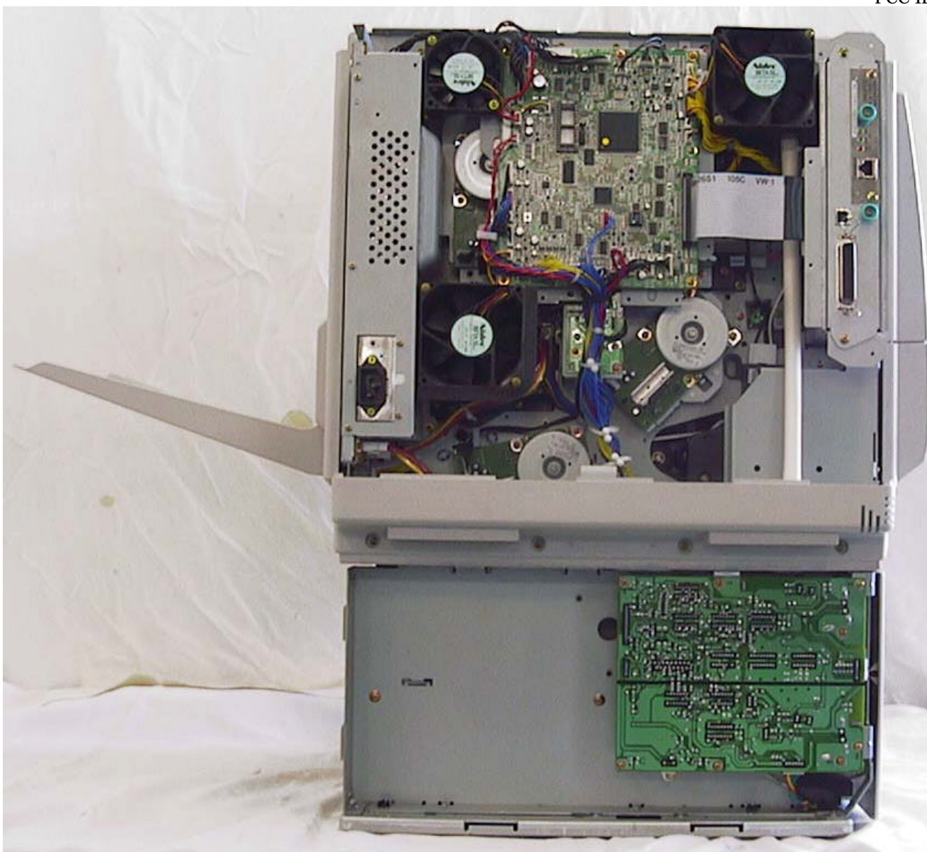
Photo.3 Rear inside view of the EUT with Rear Cabinet and Engine Board Cover removed