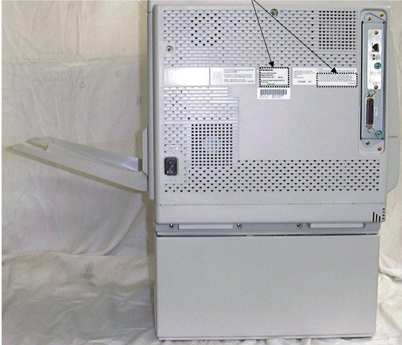
Photo.2 Overall rear view of the EUT