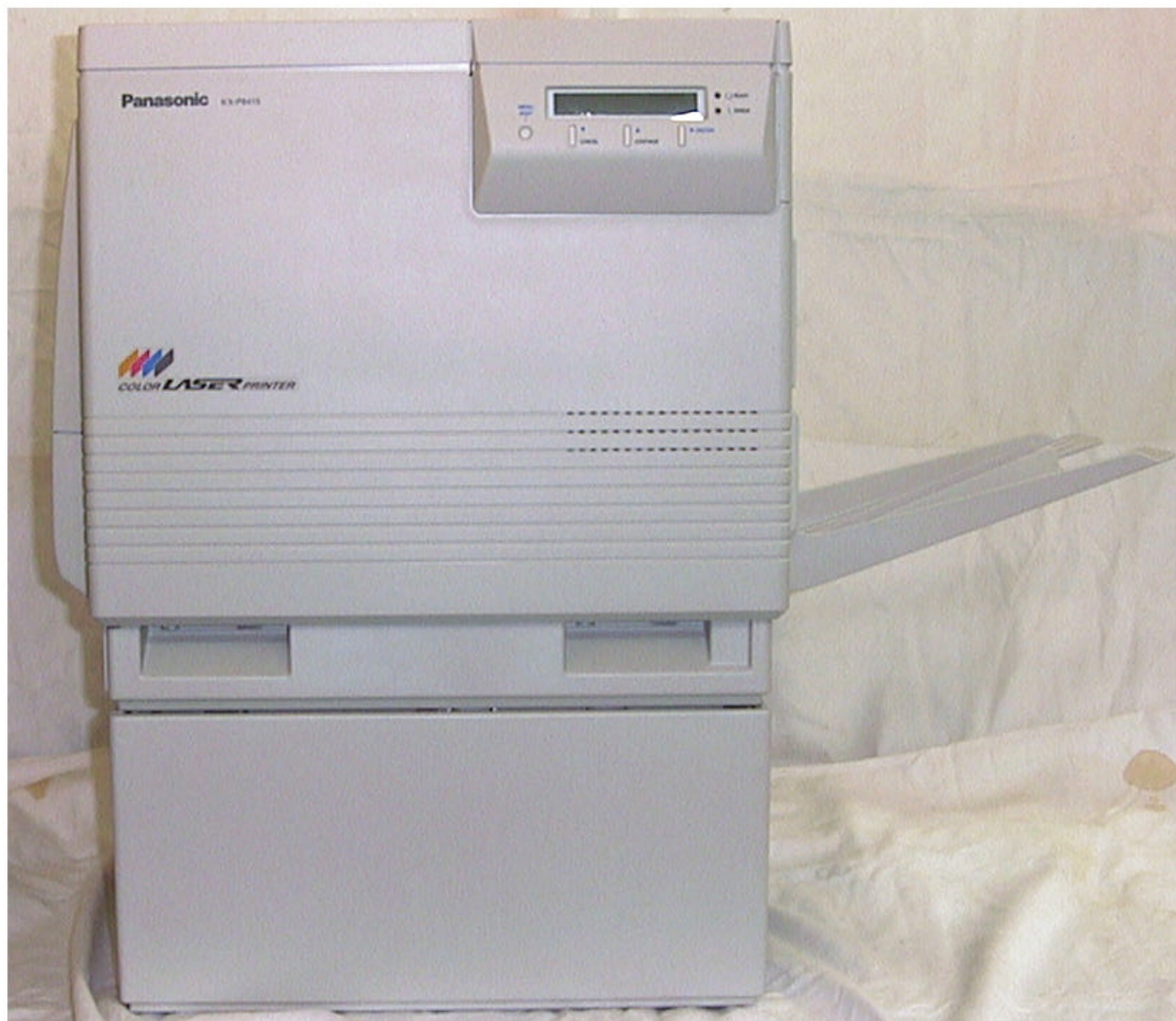
Photo.1 Overall front view of the EUT