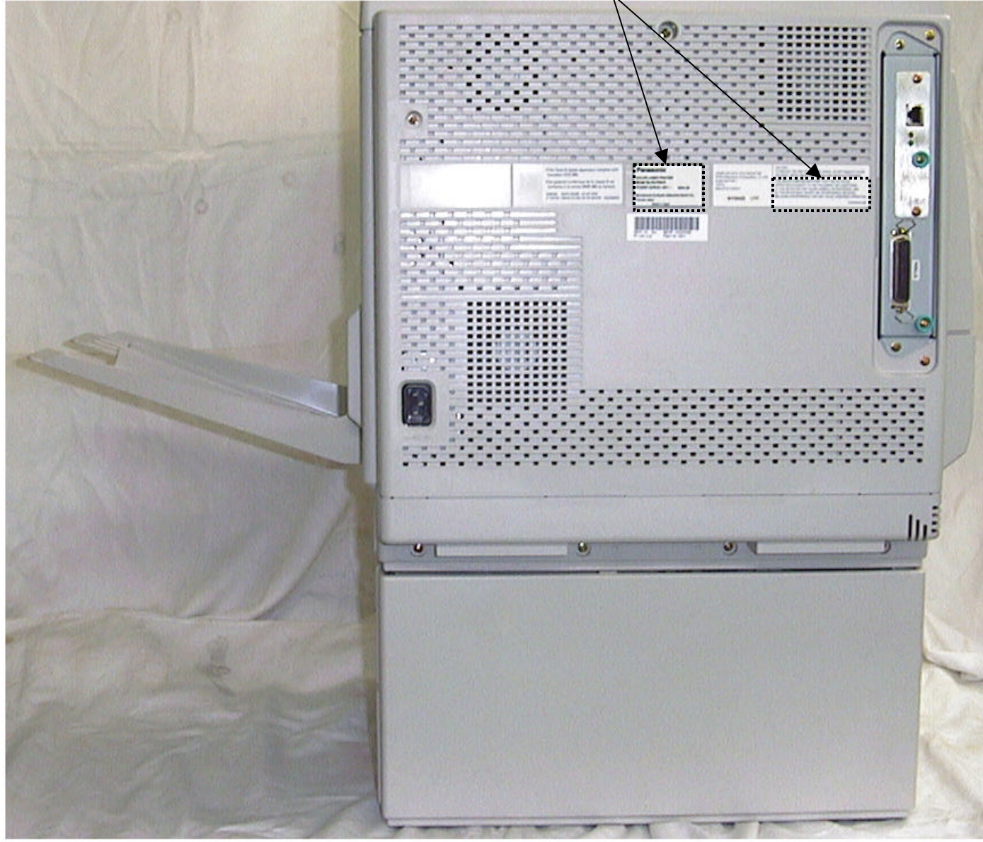
Photo.2 Overall rear view of the EUT