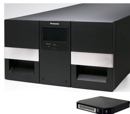
DataArchiver unit and its media