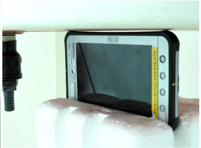
Secondary Landscape with 0 cm Gap