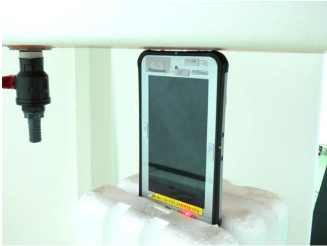
Secondary Portrait with 0 cm Gap